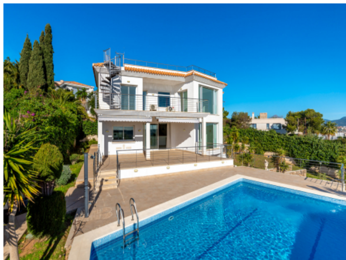
Villa with pool