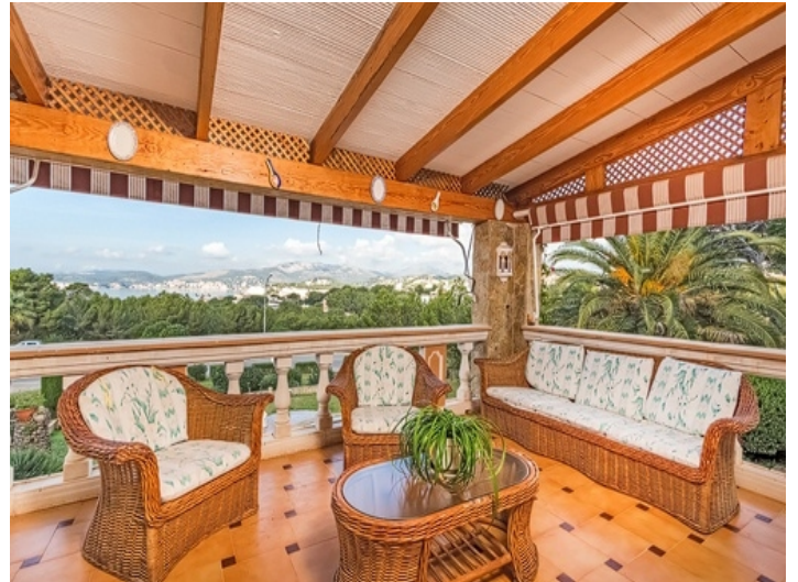
Lounge area on the balcony