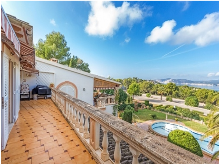
Impressive sea views from the balcony