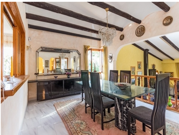
Traditionall dining area