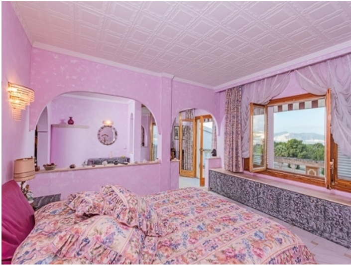
Bedroom with magnificent landscape views