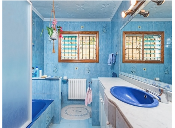
Bathroom with daylight and bathtub