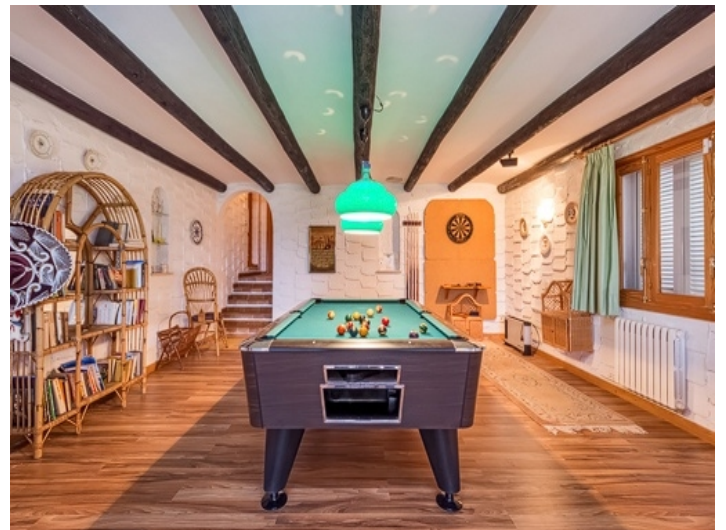
Gorgeous billiard room