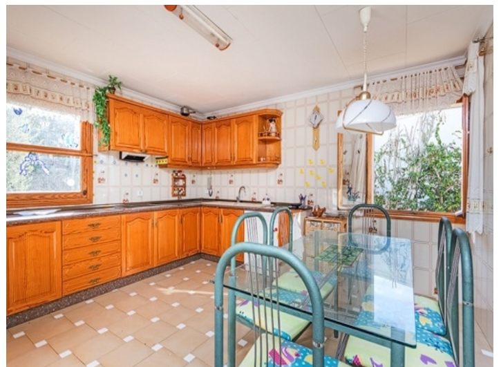
Fully equipped kitchen with dining area