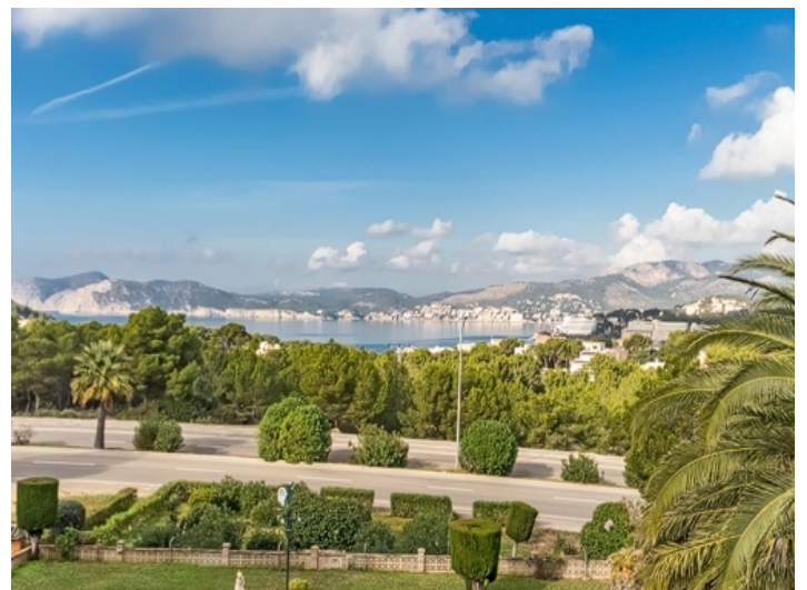
Unique sea views from the villa