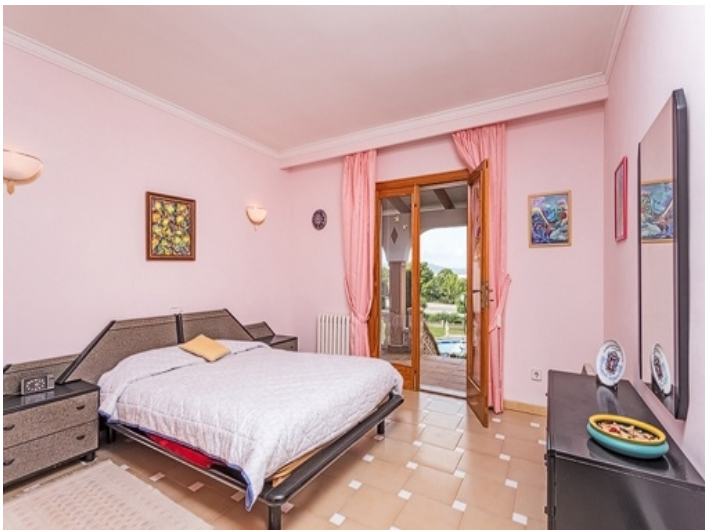
Spacious bedroom with balcony