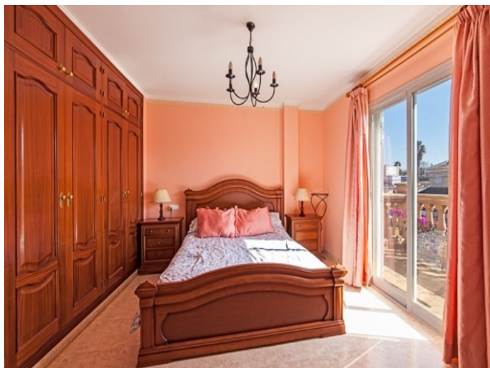
Master bedroom with access to terrace