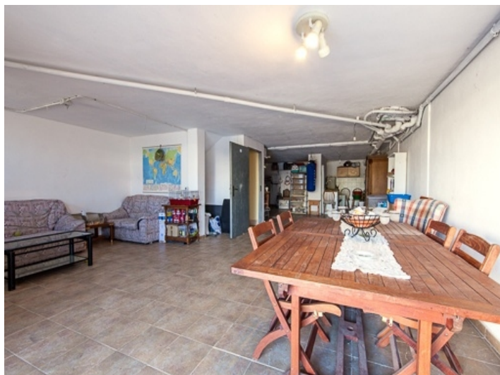
Garage can be converted into guest apartment