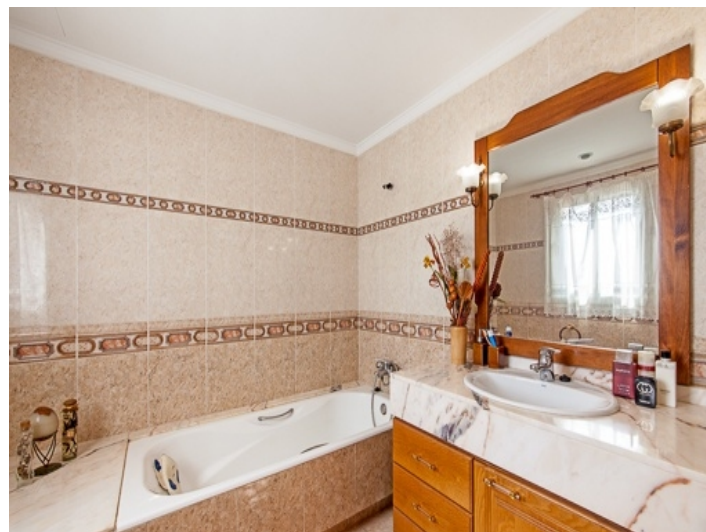
One of three bathrooms with bathtub