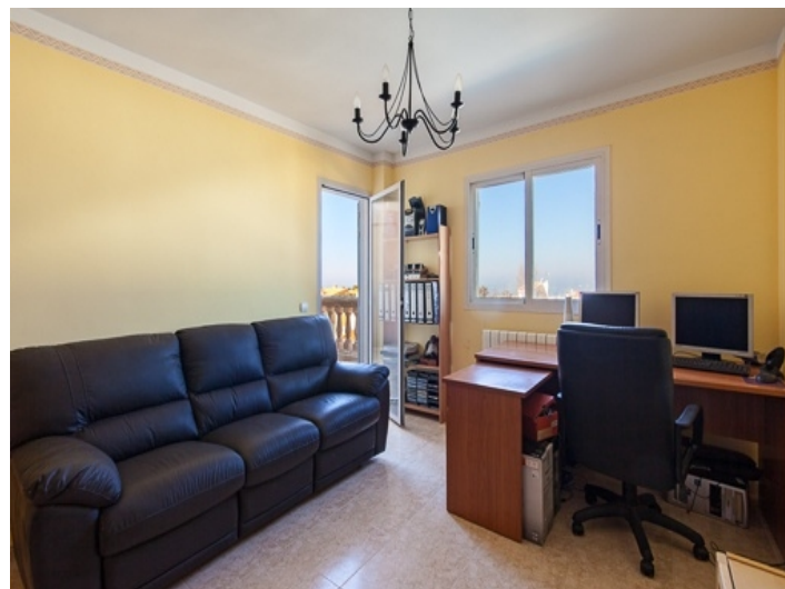
Office with access to balcony