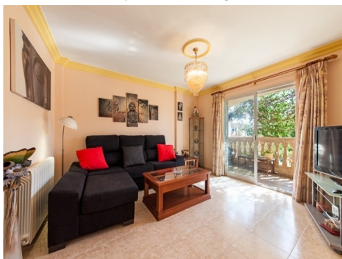
Cosy living area with access to terrace