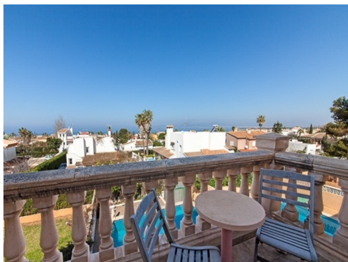
Balcony with view of the garden