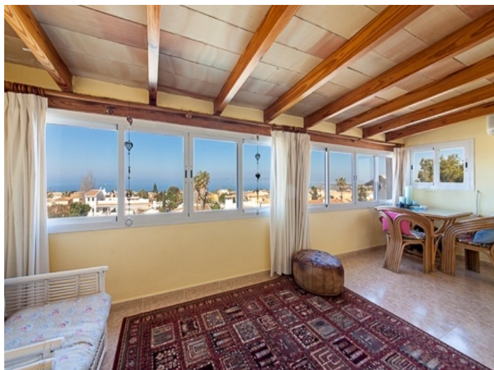
Bedroom with fantastic sea views