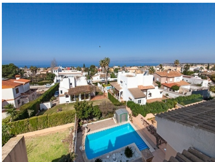
Impressive sea views