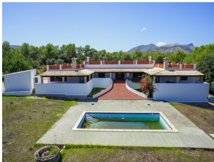
Mediterranean garden next to the pool area