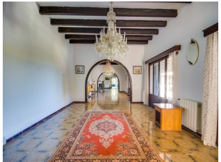
Impressive entrance hall