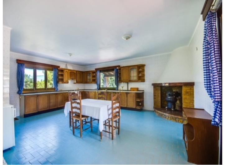
Kitchen flooded with light with rustic furniture