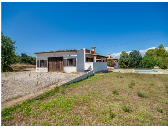
Mediterranean garden next to the pool area