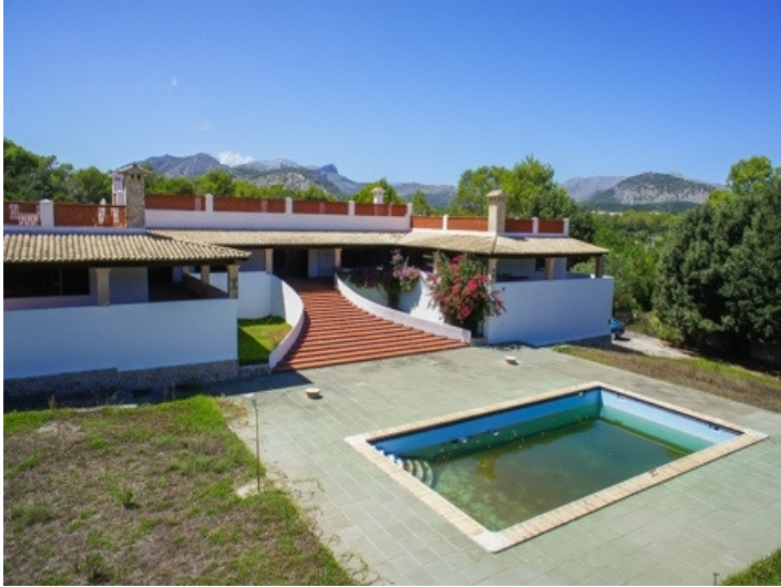
Open pool area