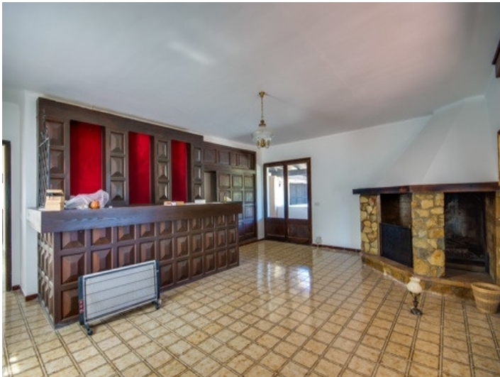
Original bar with fireplace