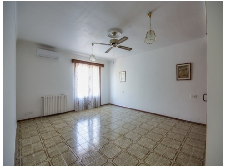
Small bedroom with large windows and heating