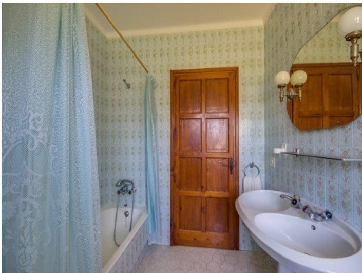
Rustic bathroom with bathtub