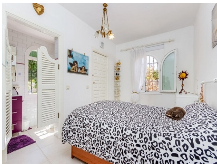
Bedroom with balcony acces