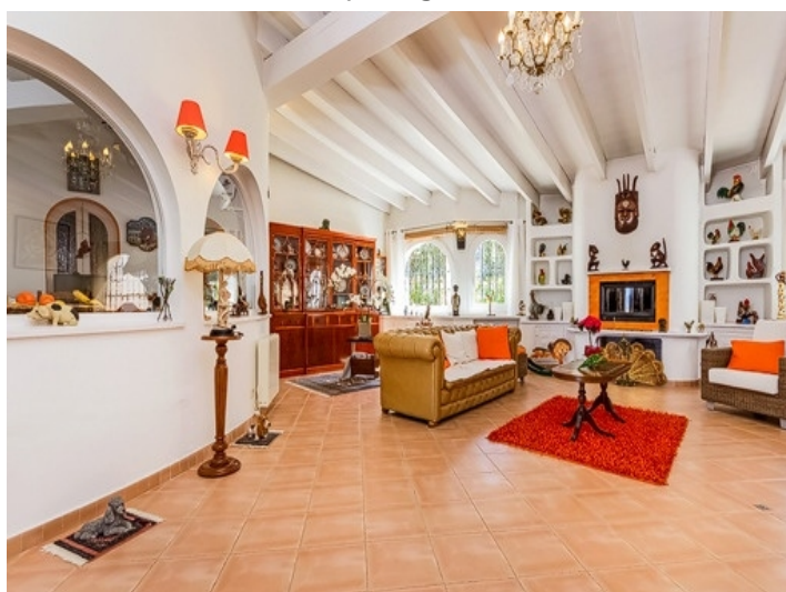
Spacious living area