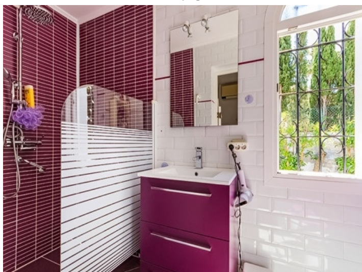
Stylish bathroom with shower