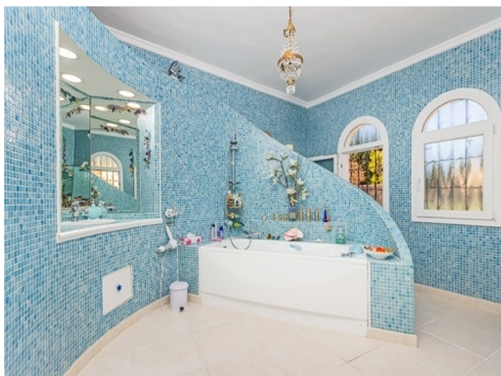
Bathroom with daylight and bathtub