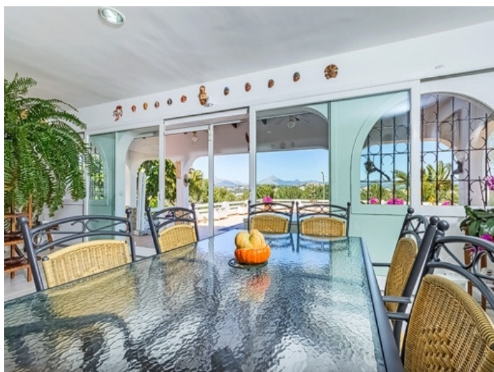
Dining area with direct terrace acces