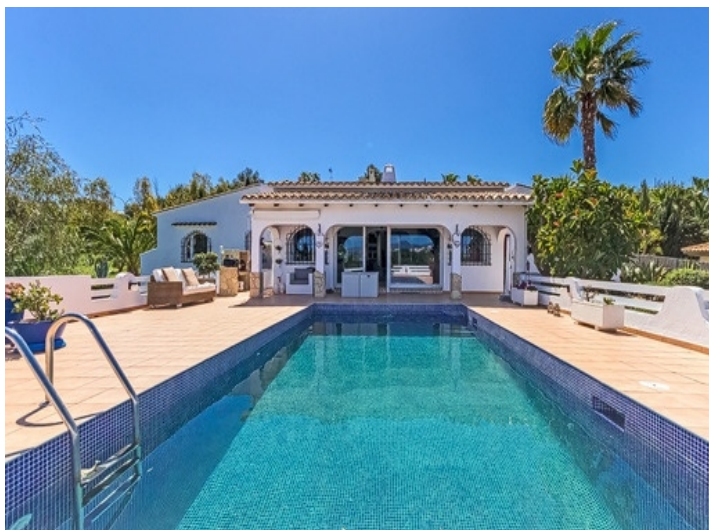
Impressive pool area