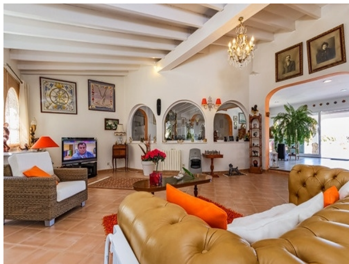
Cosy living area