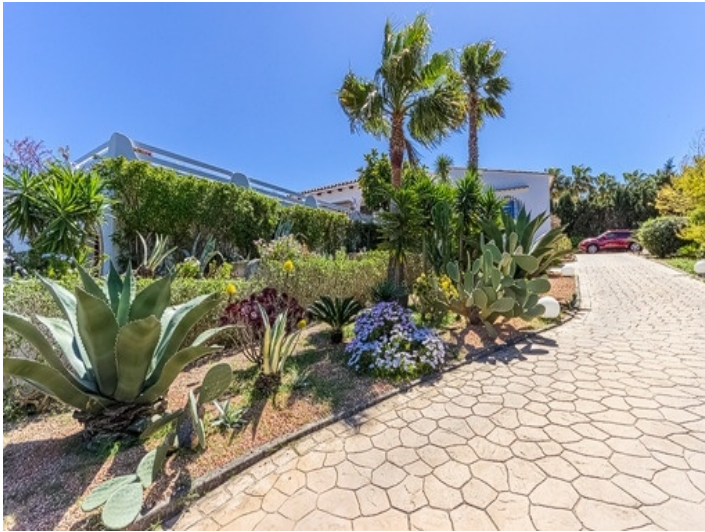
Mediterran driveway to the property