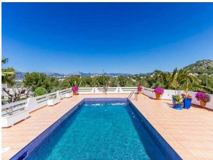
Unique landscape views from the pool area