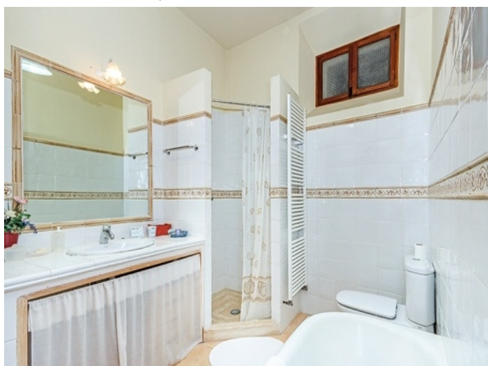
Bathroom with shower and bath tub