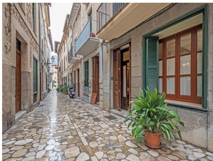
Street view of the town house