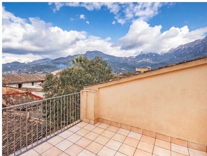
Nice roof terrace