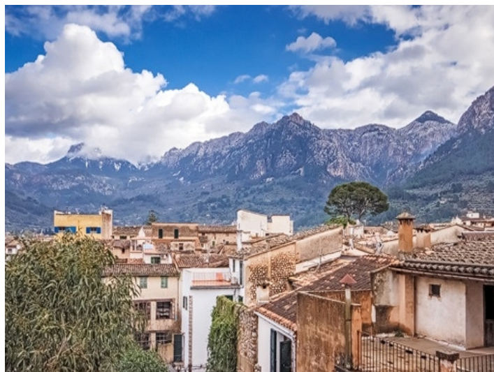
Fantastic view of the surrounding