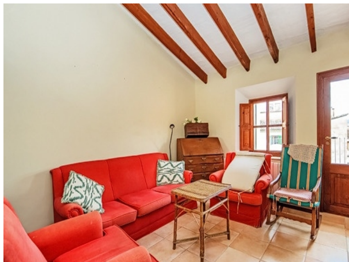
Cosy living area