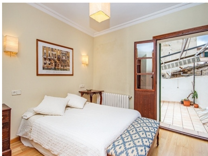
Bedroom with access to terrace