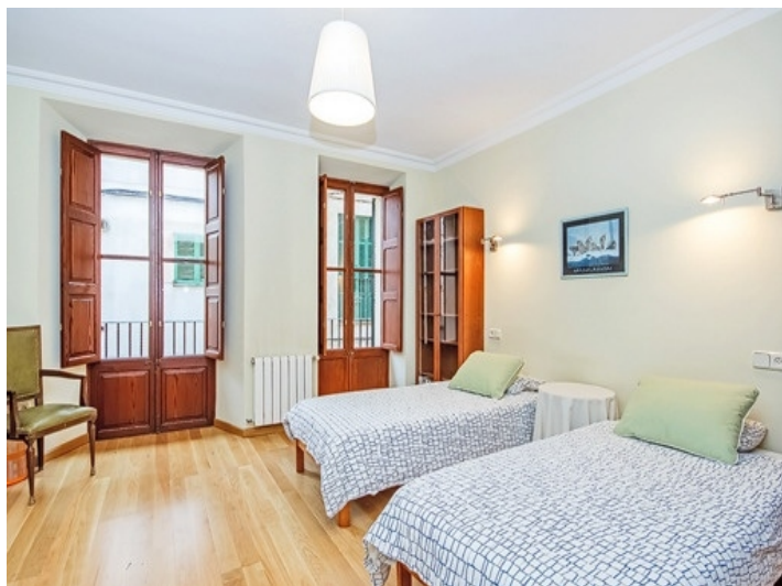
Spacious double bedroom