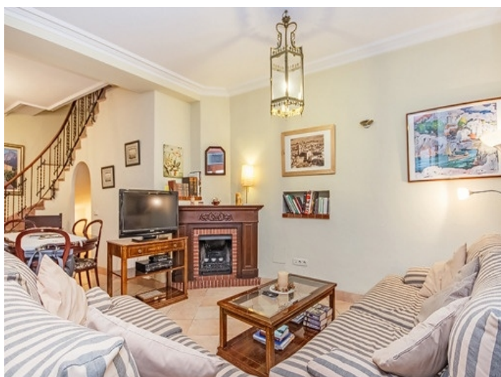
Cosy living room with fireplace