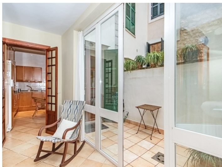
Alternative view of the covered terrace