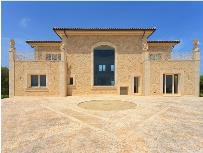
Front view of the fantastic mansion in Muro