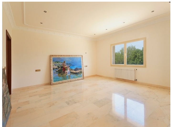
Exklusive double bedrooms on the ground floor