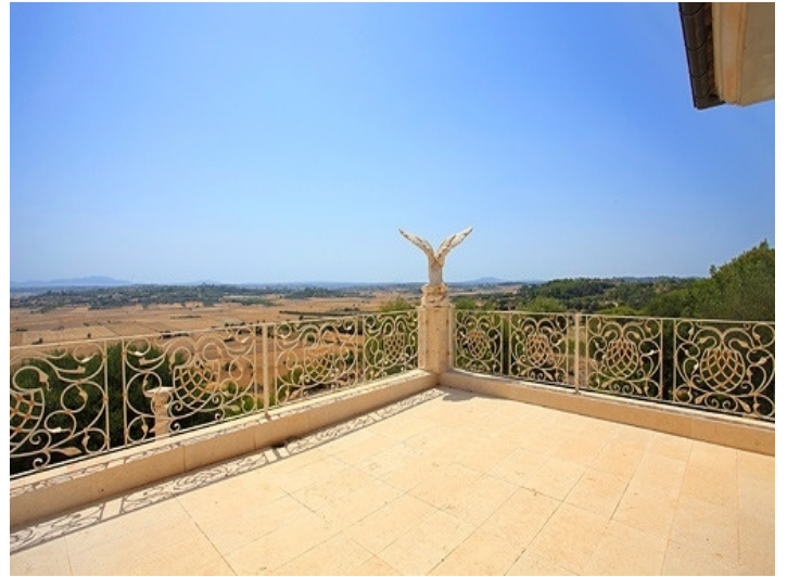
Spacious terraces of the master bedroom