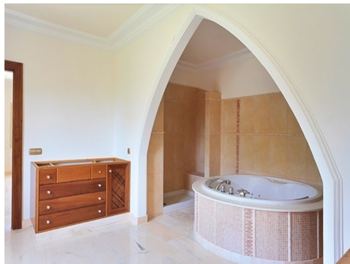
Jacuzzi in the main bathroom on the ground floor