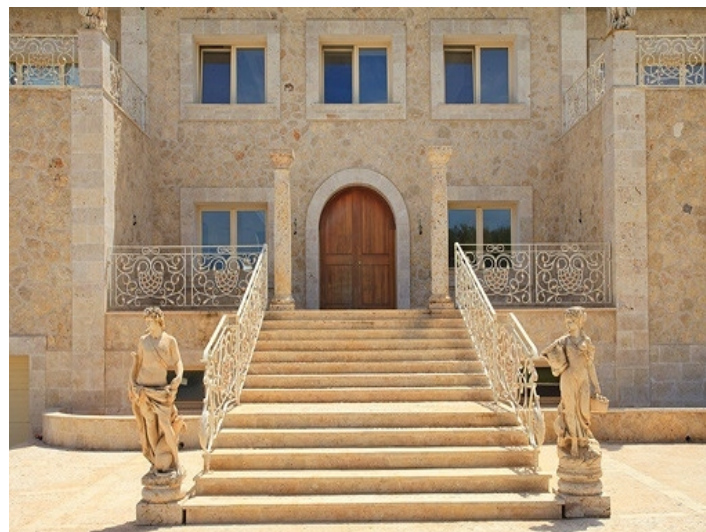
Impressive entrance of the property