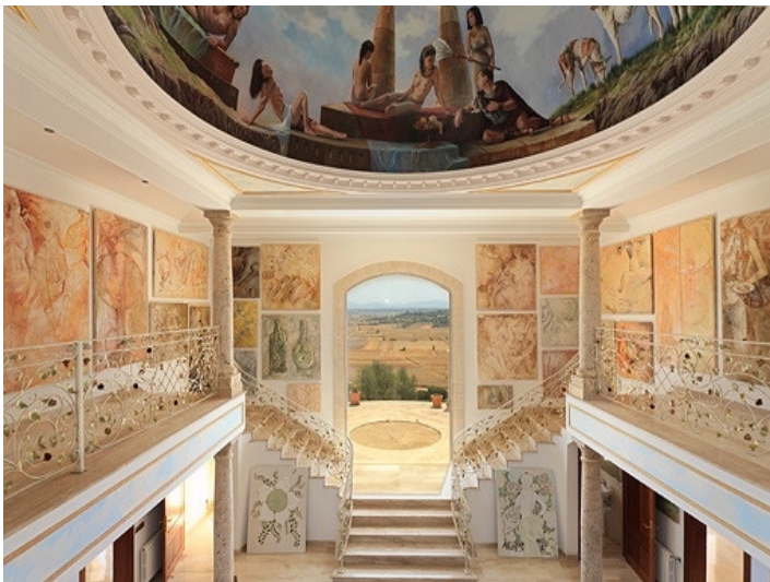
Under the dome impresses the ceiling fresco