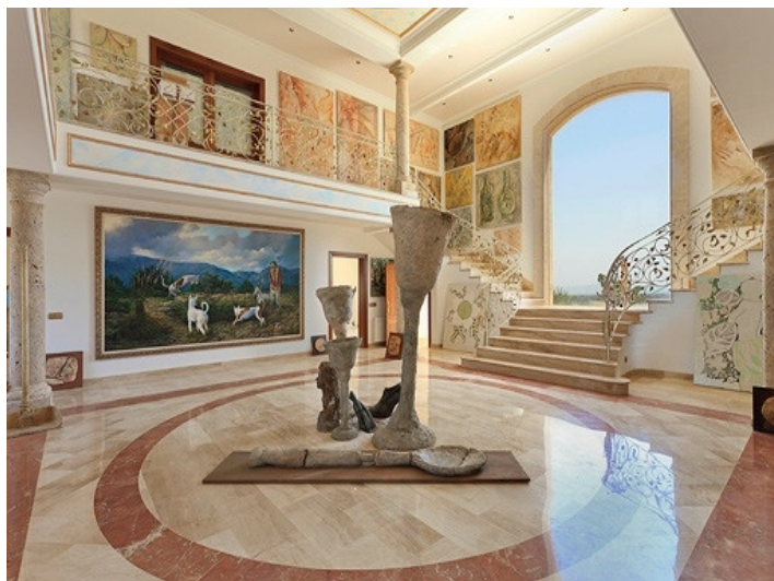
Panoramic window of the hall