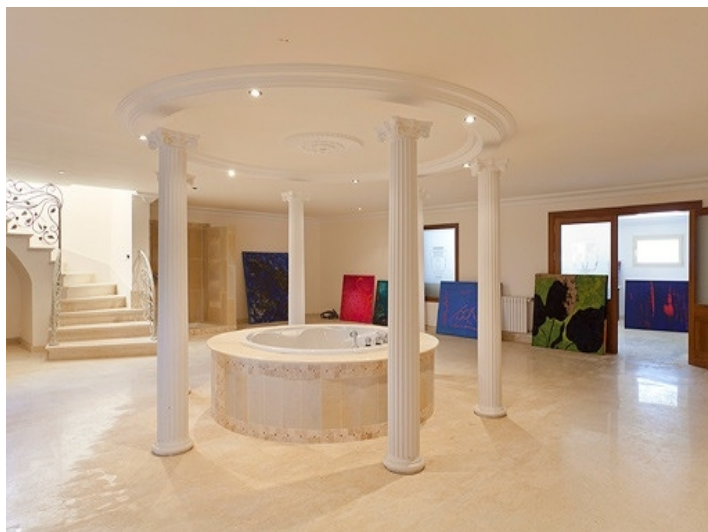
Spa zone on the souterrain