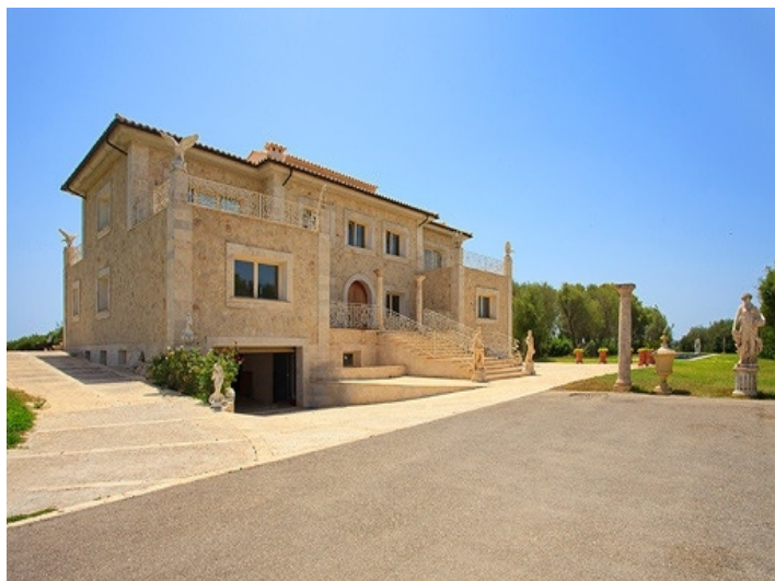
View of the mansion from the driveway