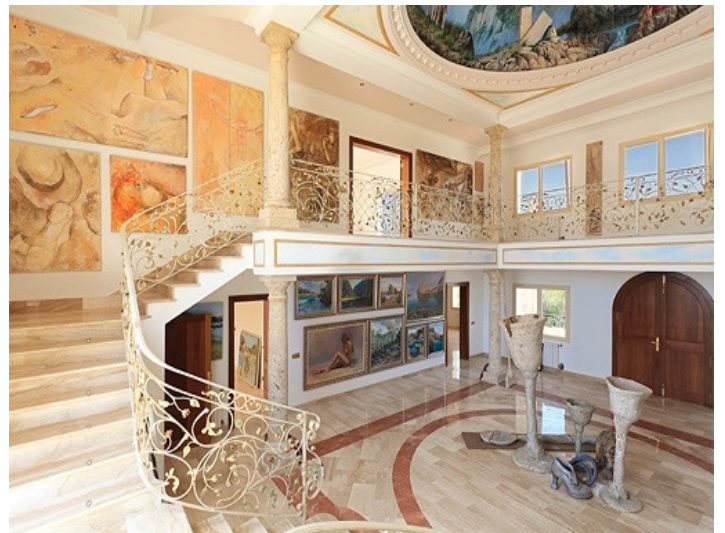
An U-shaped stair with an intermediate landing leads to the