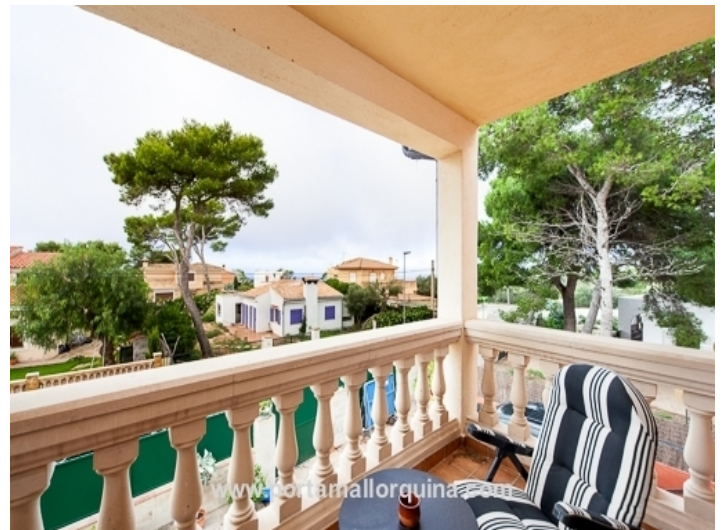
Views from the upper floor