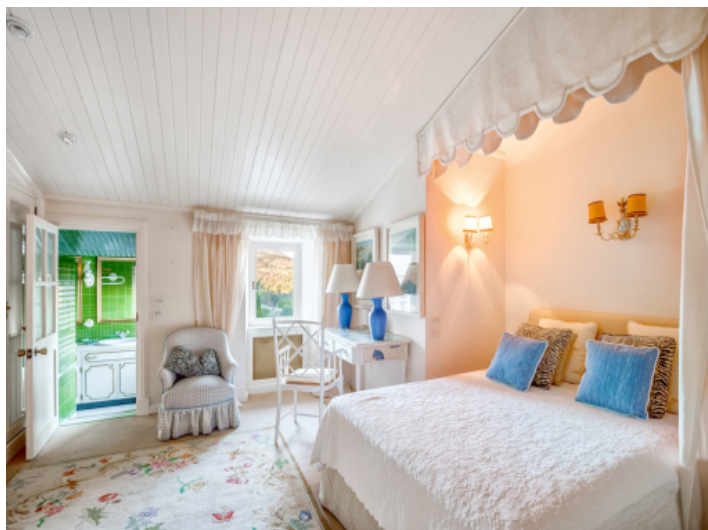
One of 10 bedrooms