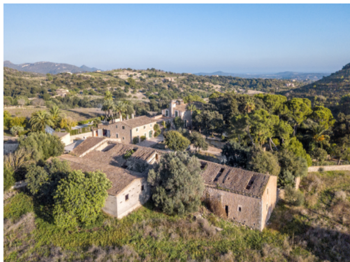
Brid's-eye view of the surroundings