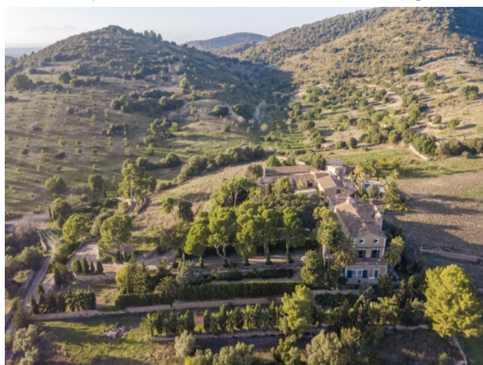
Bird's-eye view of the property