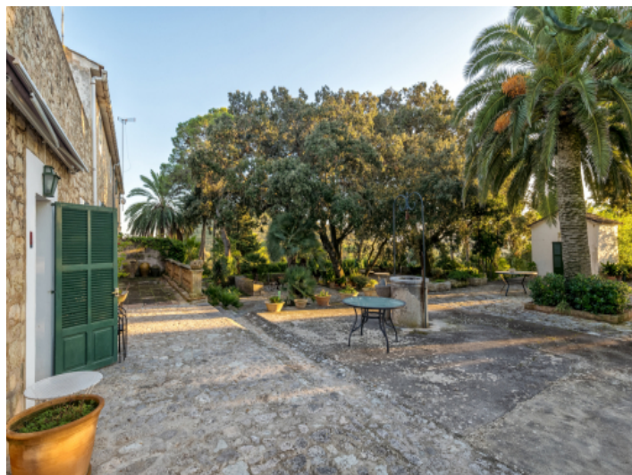
Spacious outdoor area