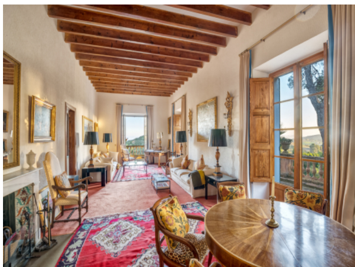
Cosy living area with wooden ceiling beams