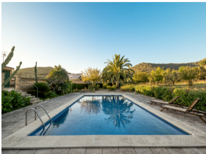
Idyllic pool area with sunbeds