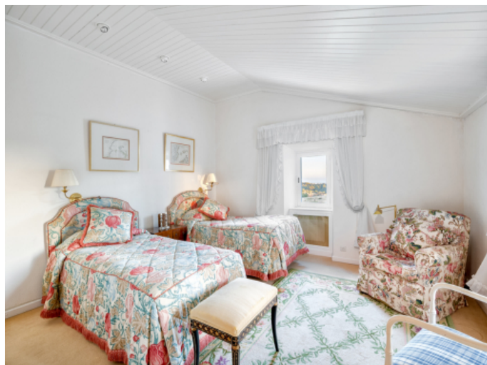
Charming double bedroom