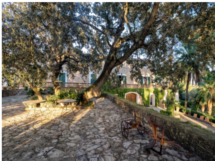
Inviting terrace of the main building