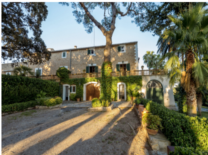
Rustic entrance area of the main building