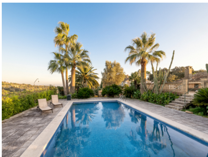
Beautiful, rustic finca with pool in Sant Llorenç