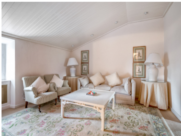
Enchanting, small living area