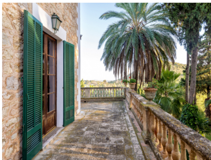
A spacious terrace surrounds the main building