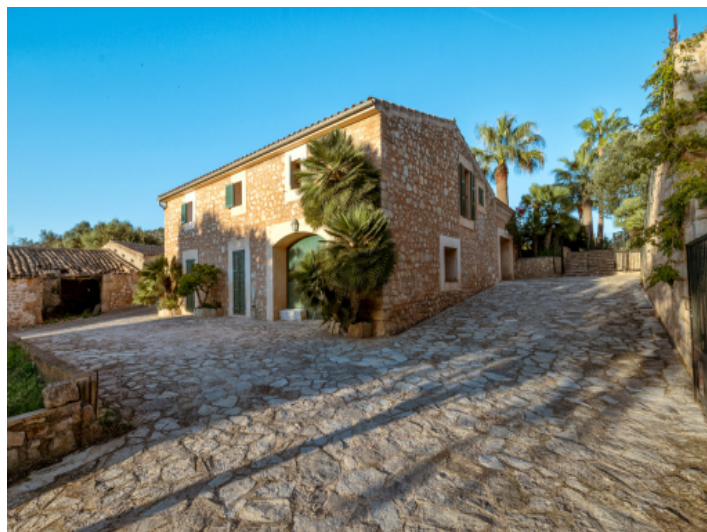
Exterior view of a side building