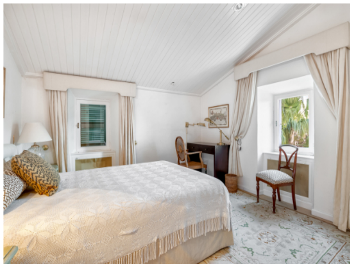
One of 10 bedrooms