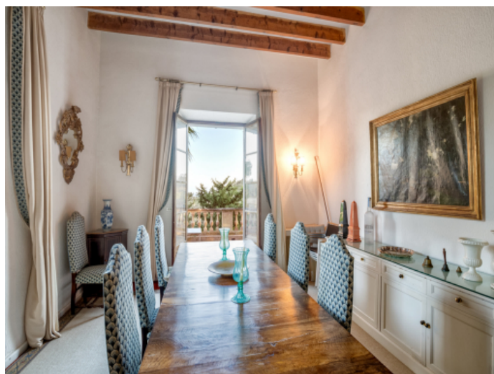
Dining area with rustic furniture