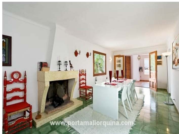
Dining area with fireplace