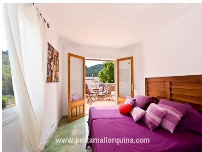
Bedroom with fantastic views