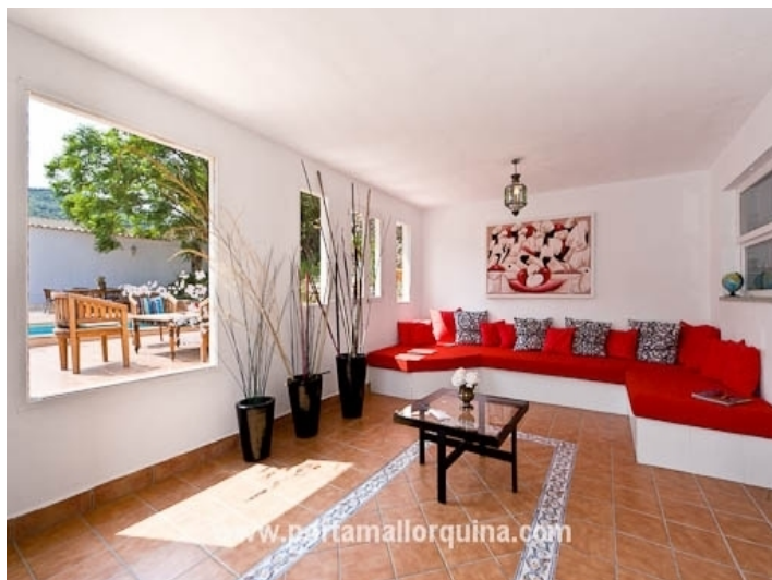
Cosy living room