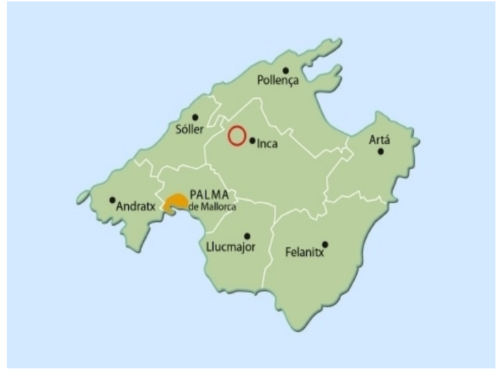
Mancor de la Vall