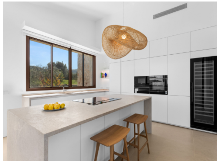
Designer kitchen with premium materials and modern