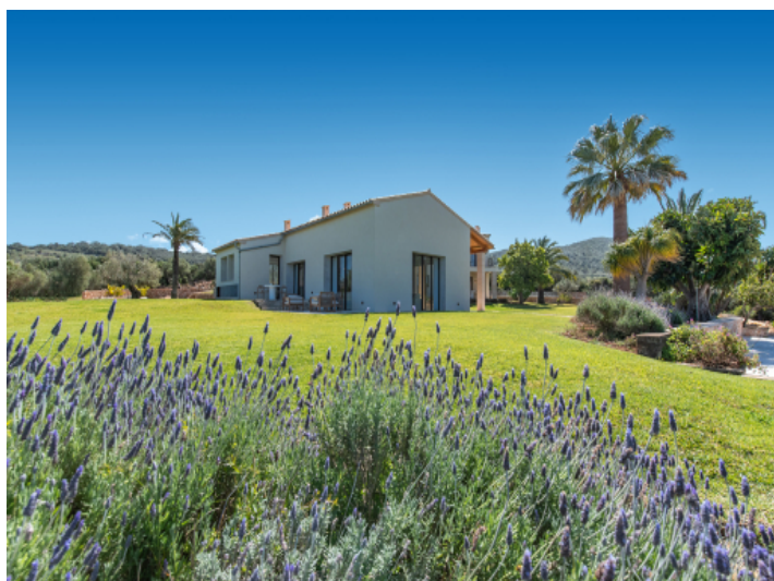
Mediterranean garden with complete privacy