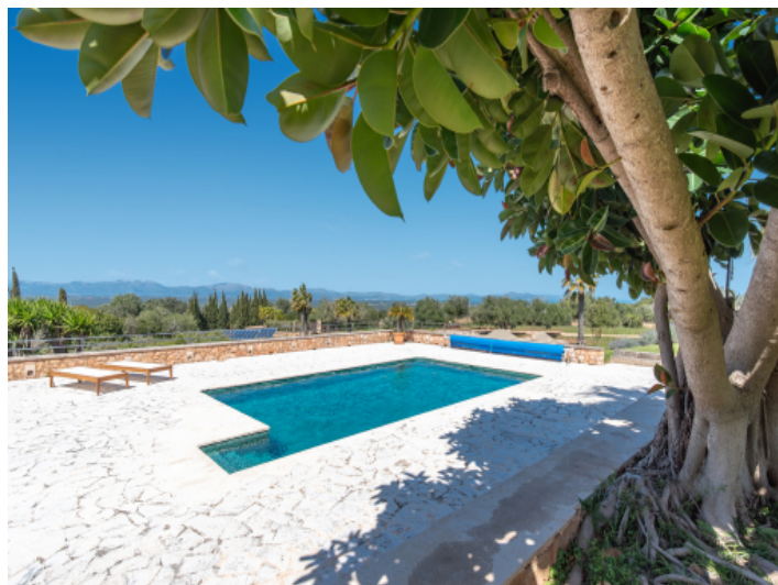
Mediterranean luxury finca with tennis court, wellness area