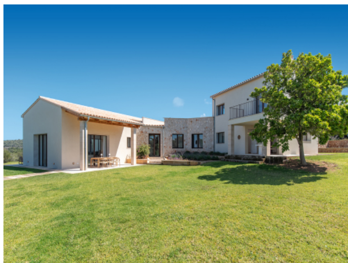
Mediterranean garden with complete privacy