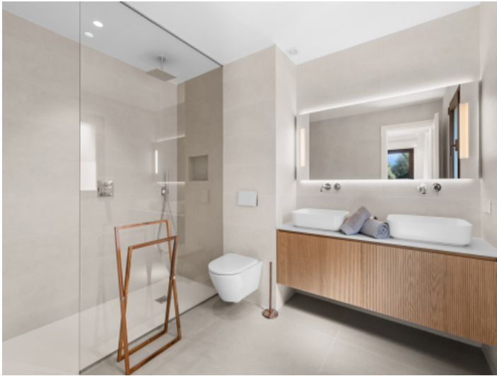
Modern en suite bathroom