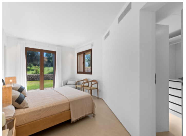
One of the 4 bedrooms with en suite bathroom and walk-in wardrobe

PORTA MALLORQUINA • C./ COLOM 20 2º, 07001 PALMA, SPAIN