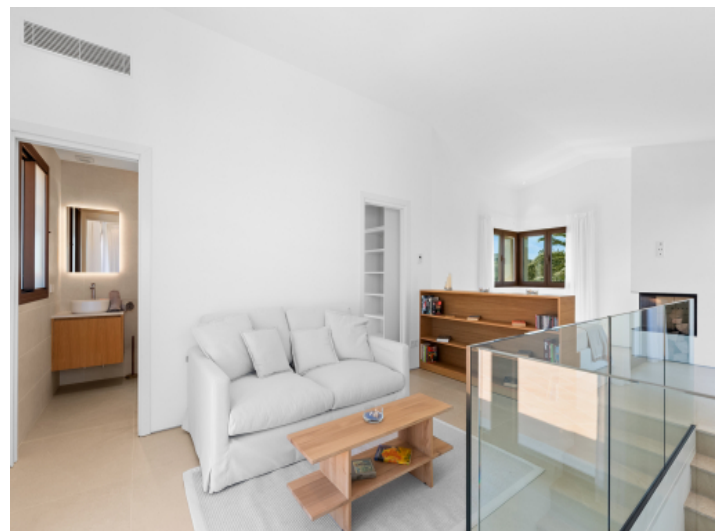
...en suite bathroom