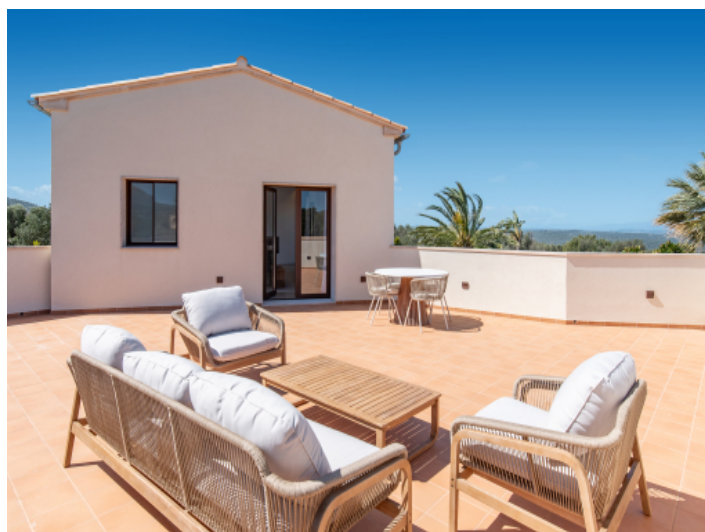
Private terrace of the master suite