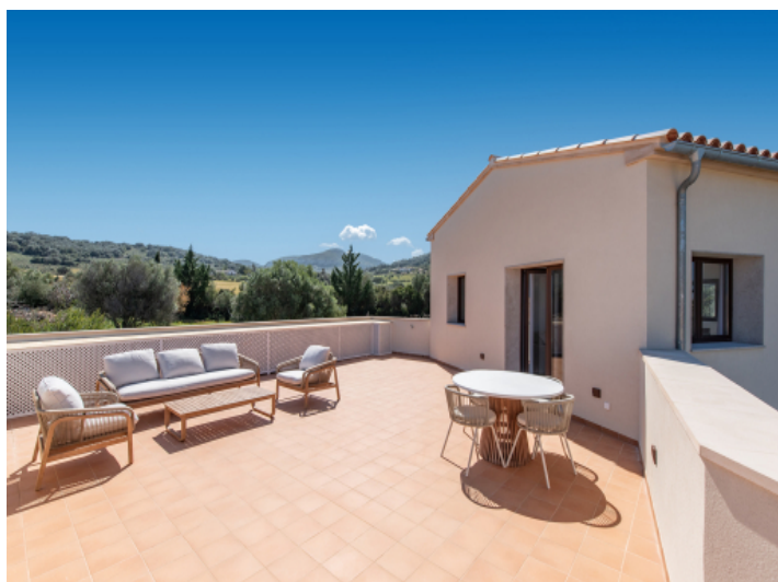
...and private terrace with panoramic views