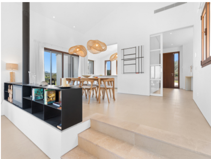
High-quality finishes and a calm and sophisticated atmosphere