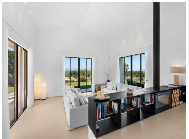
Open-plan living area with abundant natural light and views of the greenery extending to the sea

PORTA MALLORQUINA • C./ COLOM 20 2º, 07001 PALMA, SPAIN