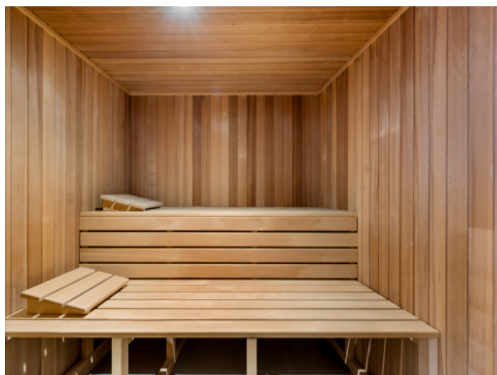
Wellness area with sauna