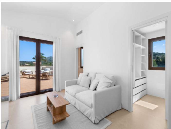
...with private living area and walk-in wardrobe