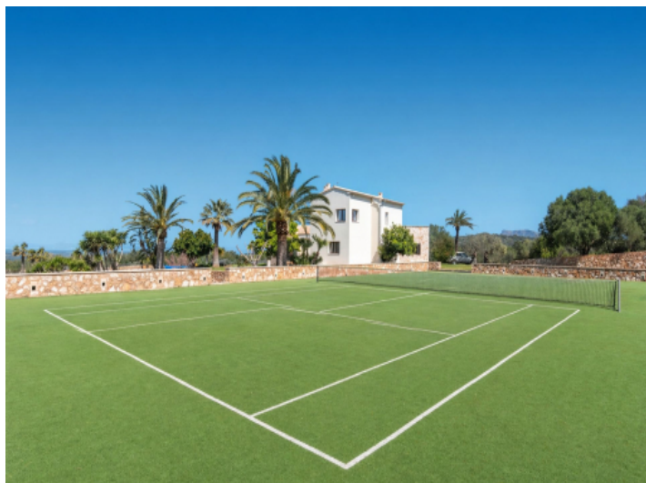
Finca with tennis court and sea views between Manacor and Colònia de Sant Pere