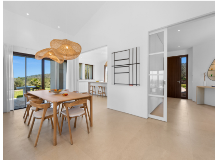
Dining area with direct access to the terrace