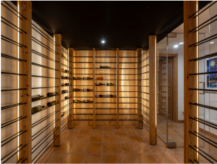
Designer wine cellar with controlled temperature and