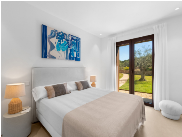
One of the 4 bedrooms with en suite bathroom and direct