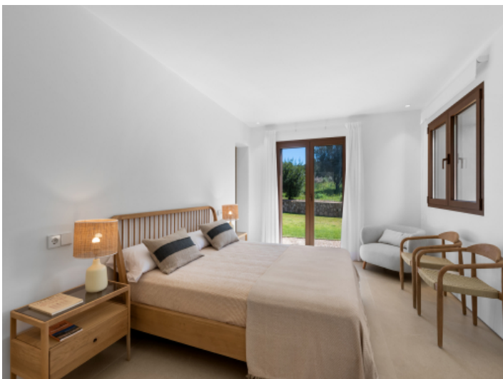
One of the 4 bedrooms with en suite bathroom and direct garden access