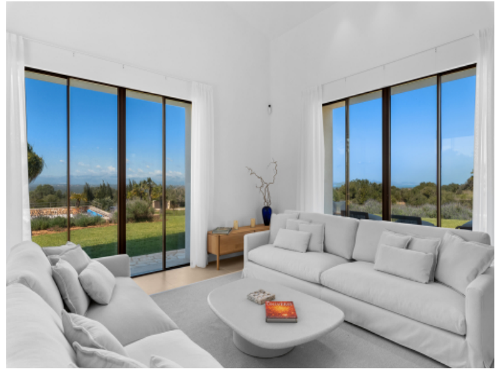
High-quality architecture harmoniously integrated into nature