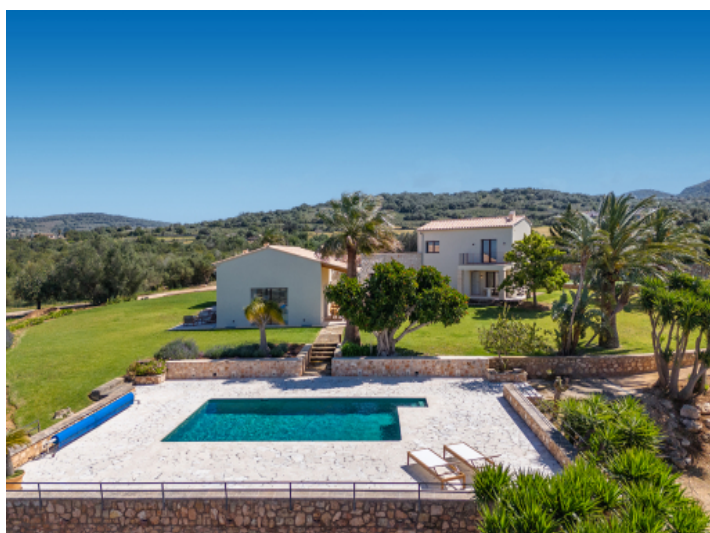
Luxury finca with tennis court, sea views and absolute privacy