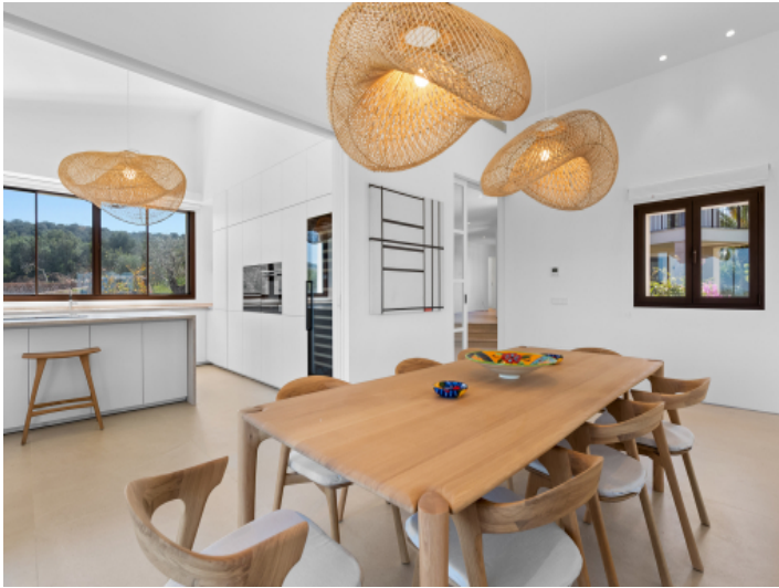
High-end, separable kitchen – ideal for maximum discretion