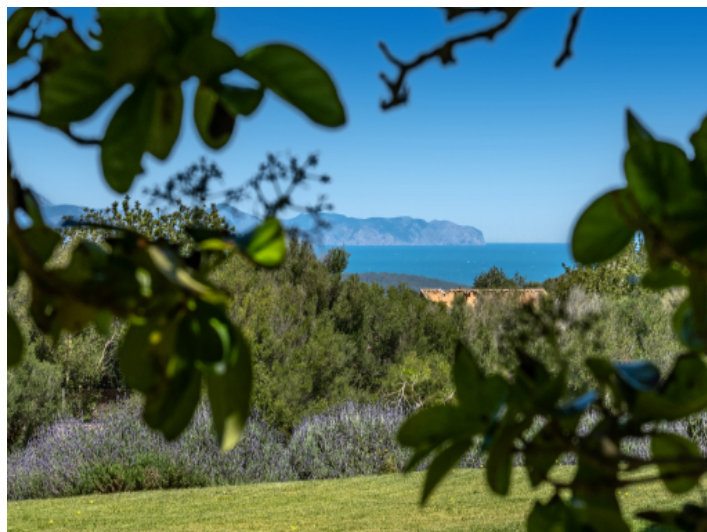
Nature and open views