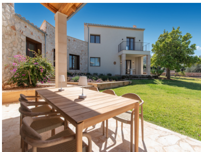
Outdoor areas ideal for relaxation and social gatherings