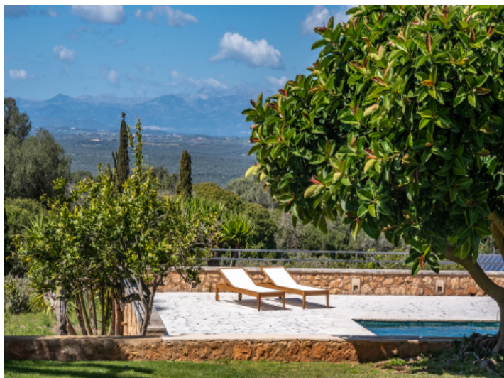
Pool and sun terrace