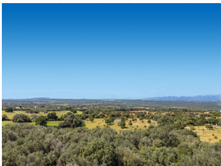
Stunning panoramic views