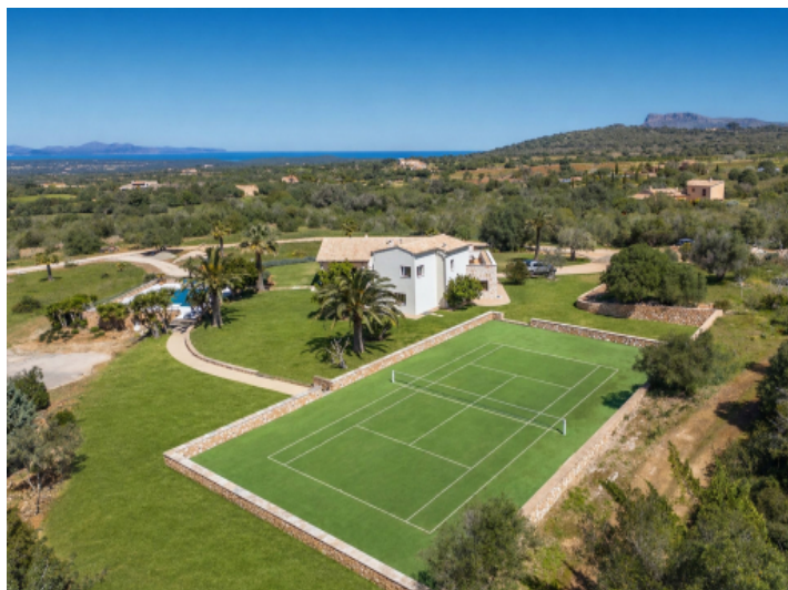
Finca with tennis court and sea views between Manacor and