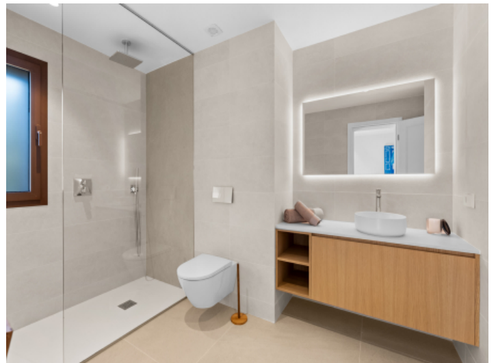
Modern en suite bathroom