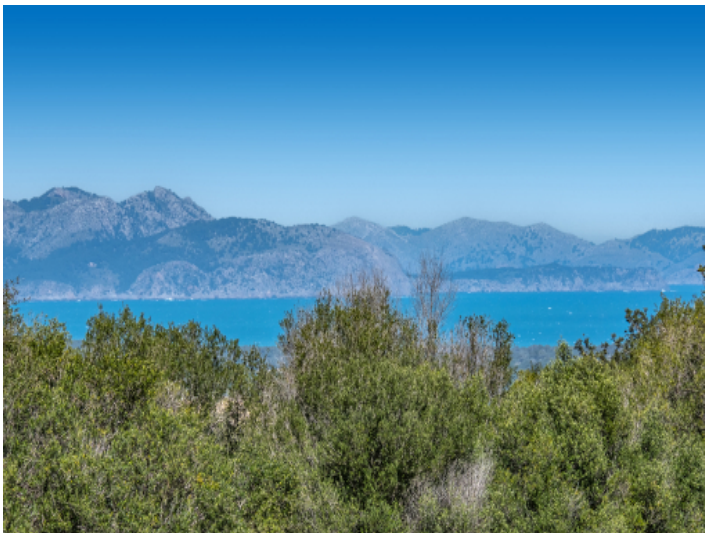
Open views extending all the way to the sea