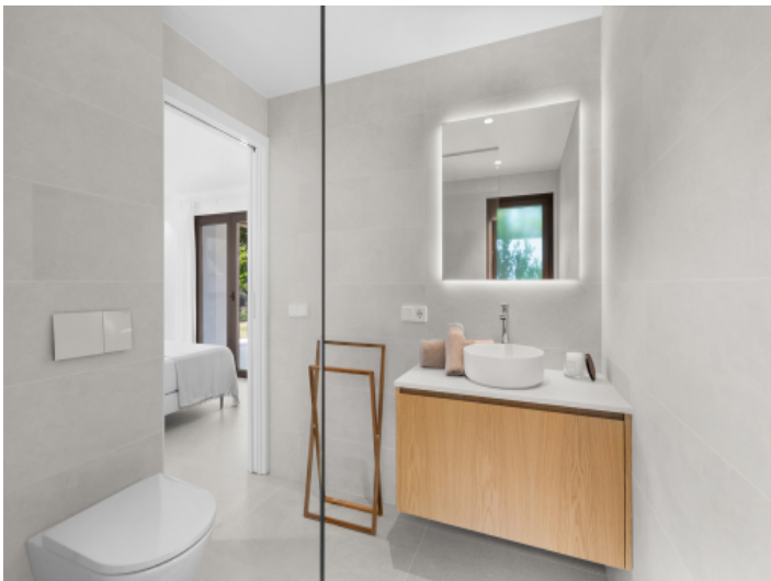
Modern en suite bathroom