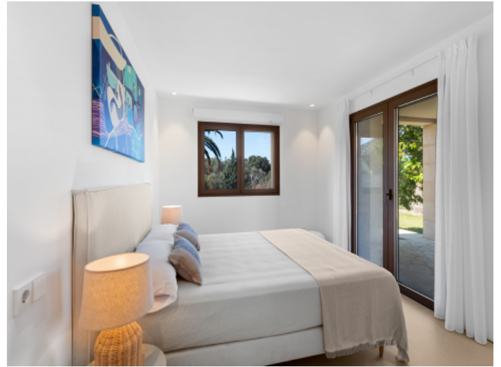
One of the 4 bedrooms with en suite bathroom and direct