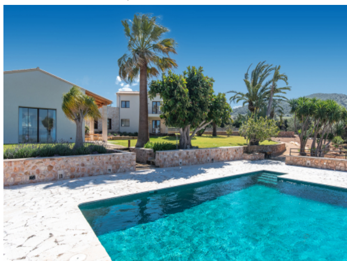
Spacious saltwater pool with sun terrace