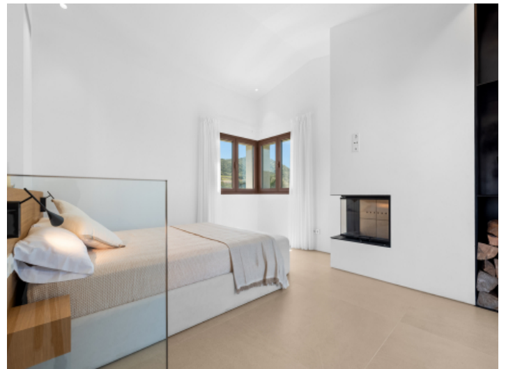
Master suite on the upper floor