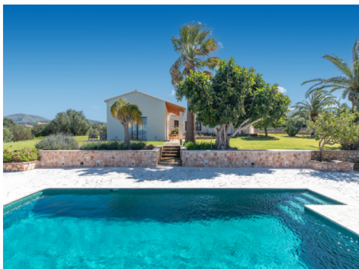
Spacious saltwater pool with sun terrace