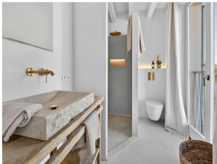
Bathroom with microcement