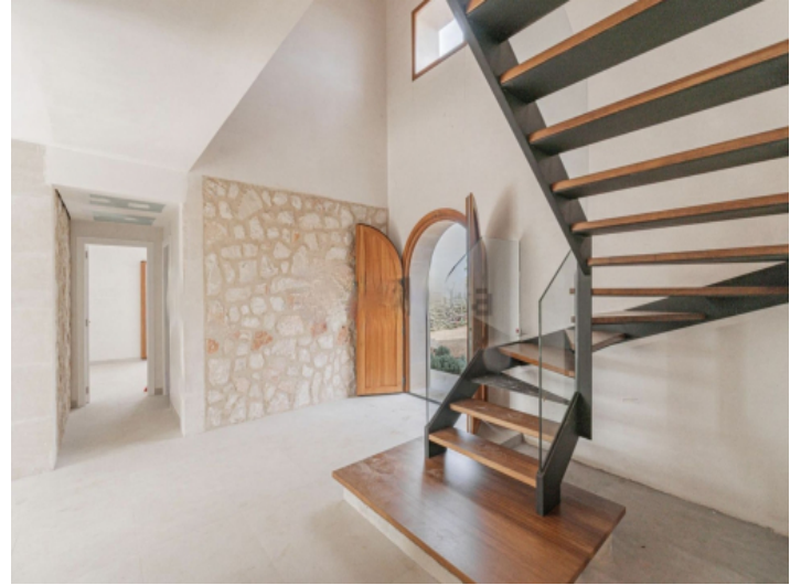
Entrance hall and stairwell