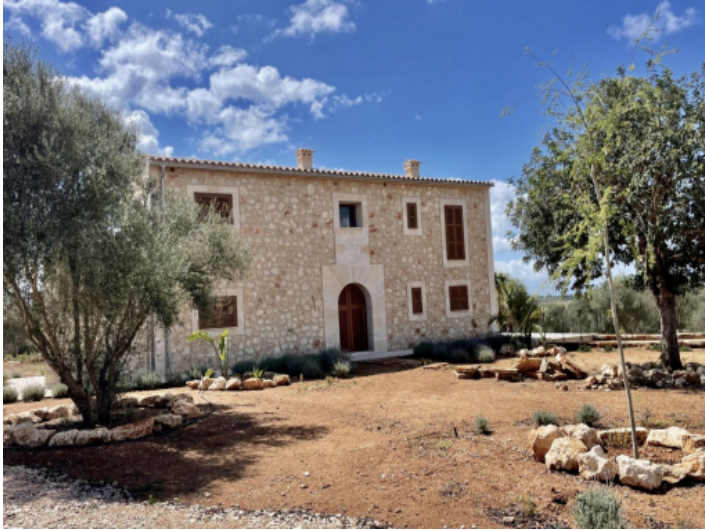
Finca in Santanyi