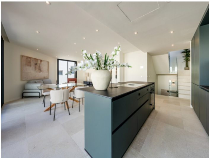
Open kitchen / living area