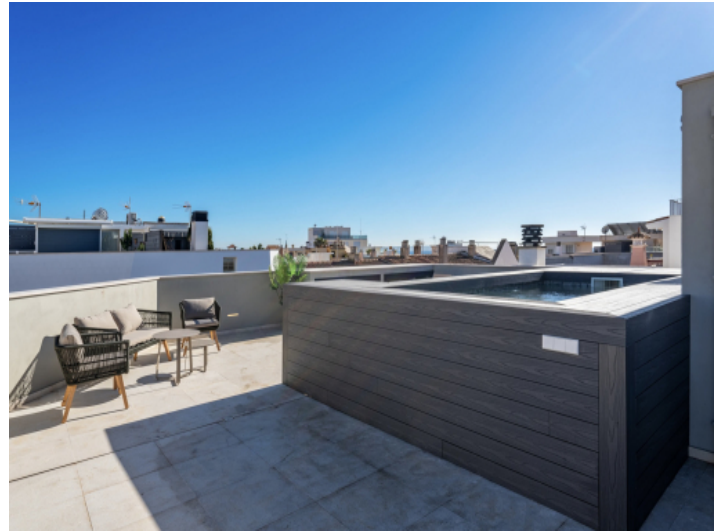
Rooftop terrace with pool