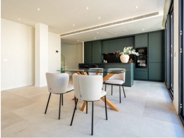
Open kitchen / living area