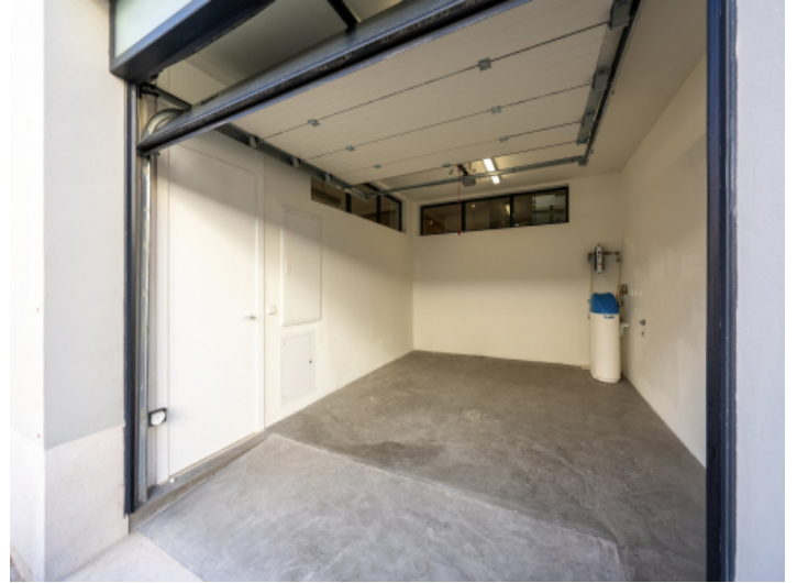
Garage with e-charging station