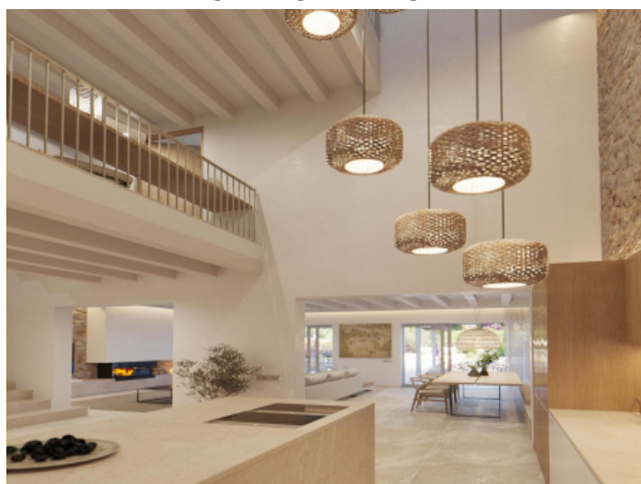
Open room concept