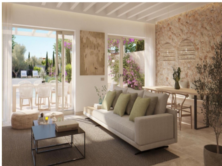
Elegante living area