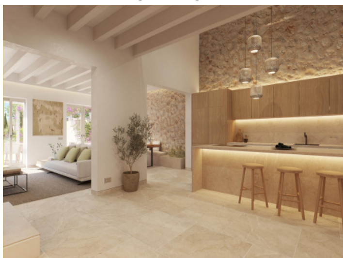
High quality kitchen