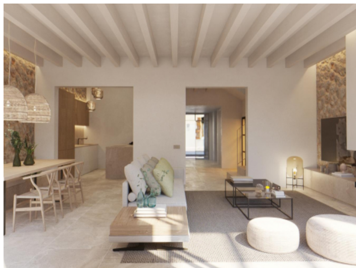
Bright living and dining area