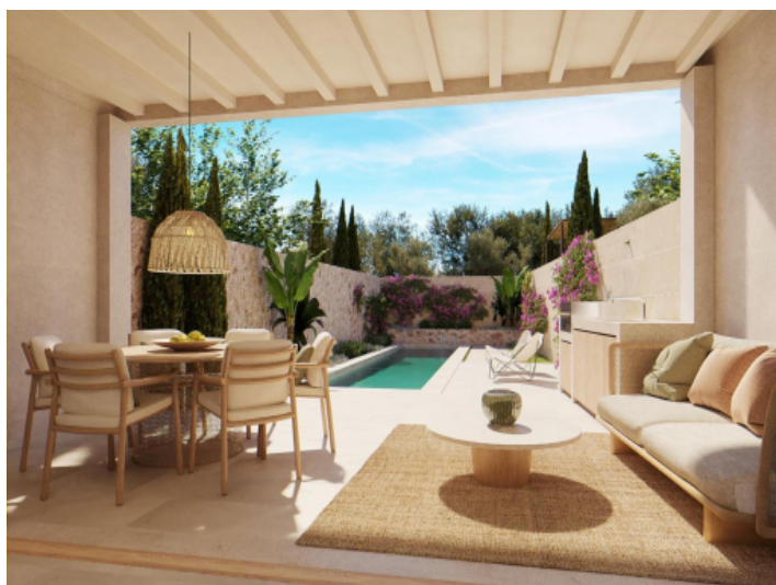
Patio with pool