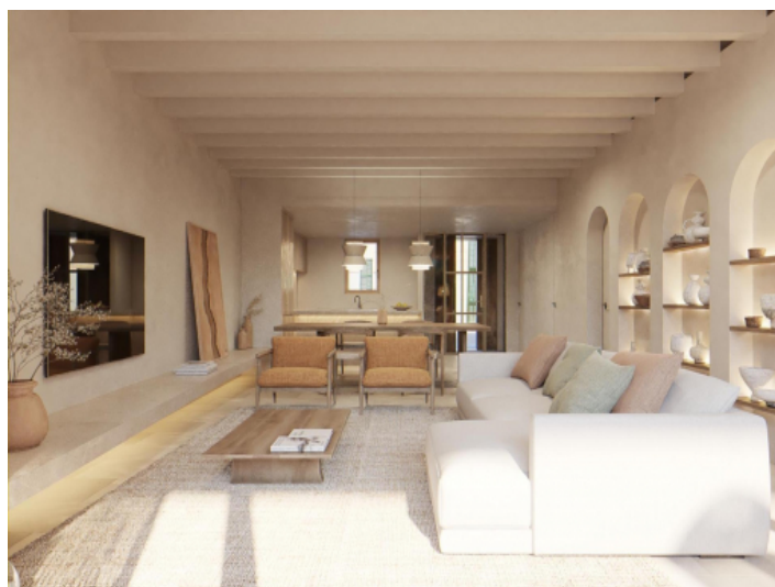
Open-plan living and dining area