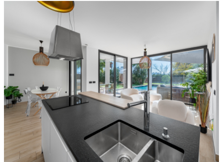
Living area Kitchen