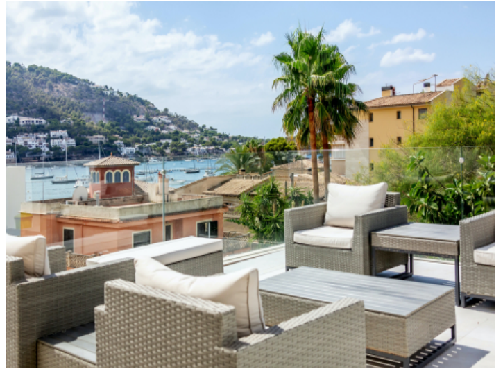
Terrace with sea views