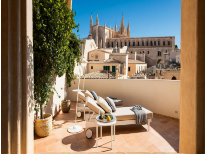
Top oldtown location