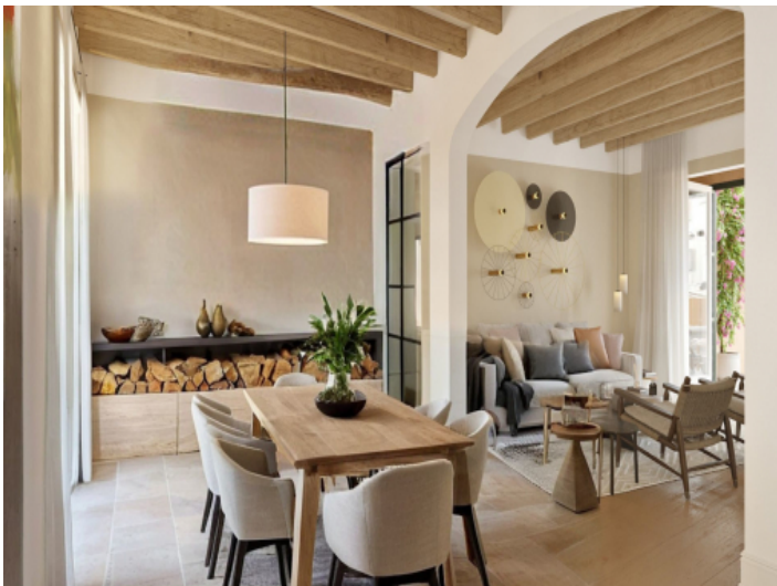
Living and dining area