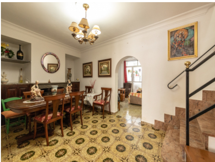
Spacious dining area