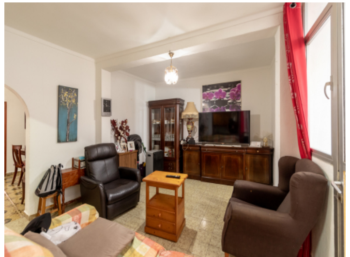
Large living area