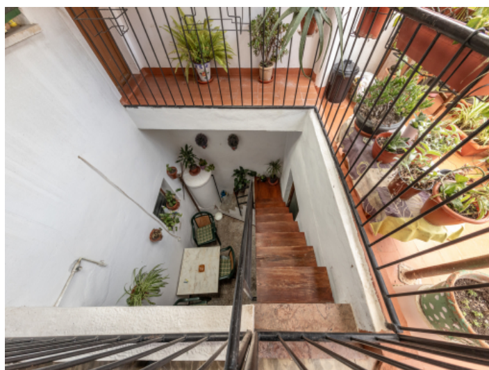
Courtyard of the property