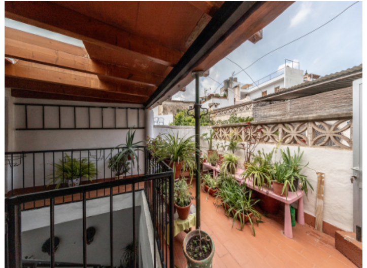
Lovely roof terrace