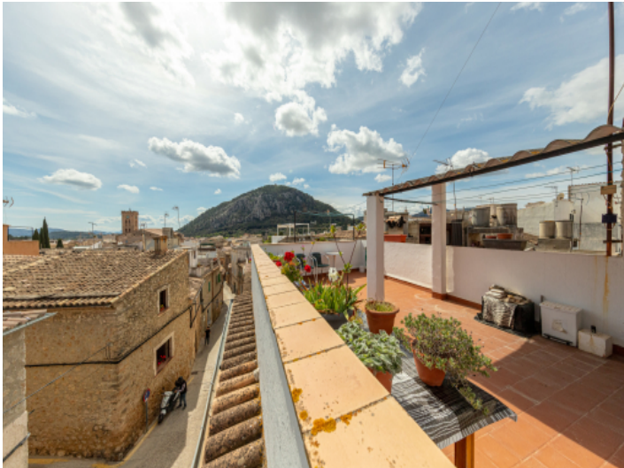
Fantastic sweeping views