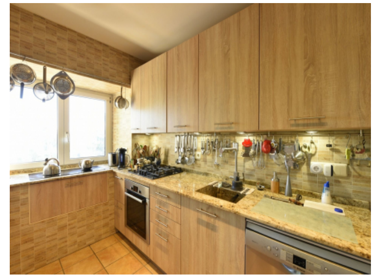
Study room Kitchen