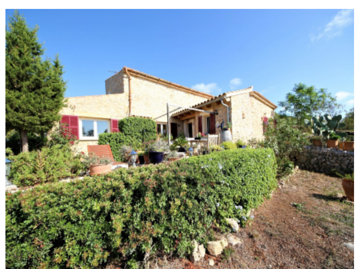
View to the finca