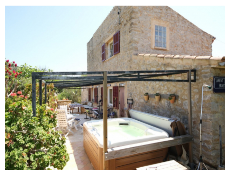
Terrace with whirlpool