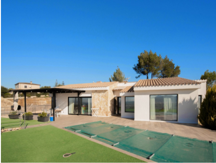
Nice pool and garden area