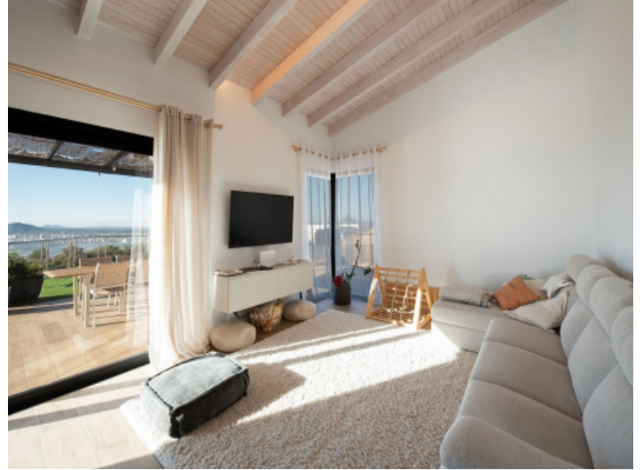
Bright living area