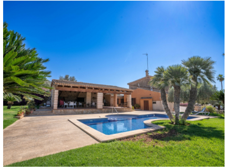
Garden and pool