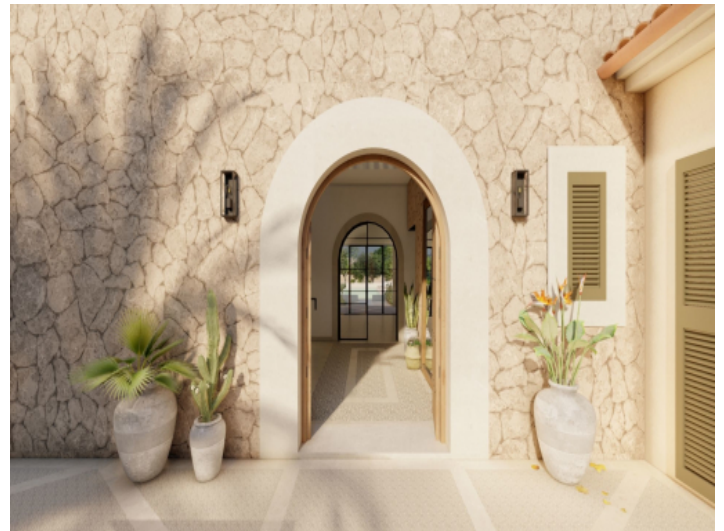
Natural stone walls