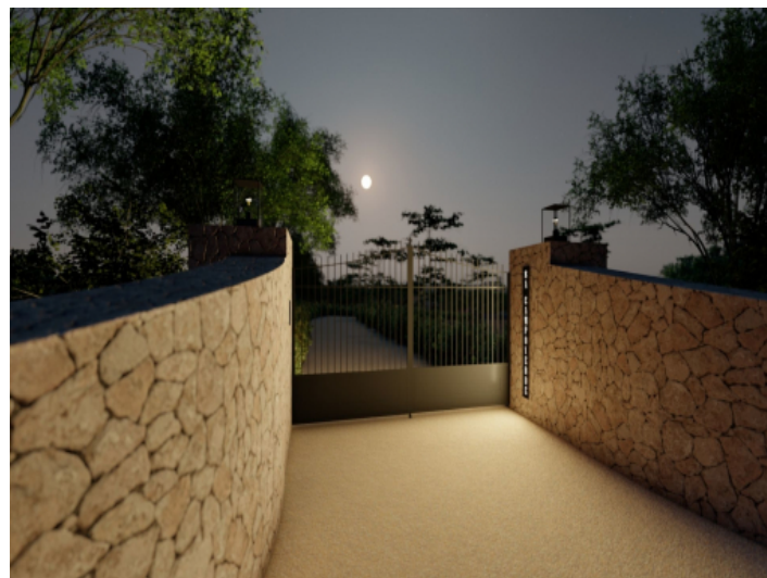
Entrance gate to the property