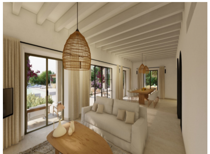
Large living room