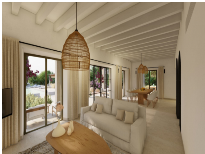
Large living room