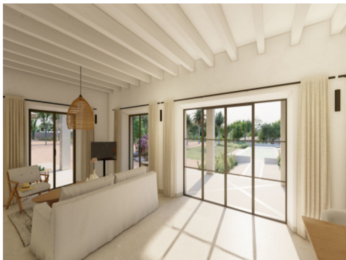
Bright living room