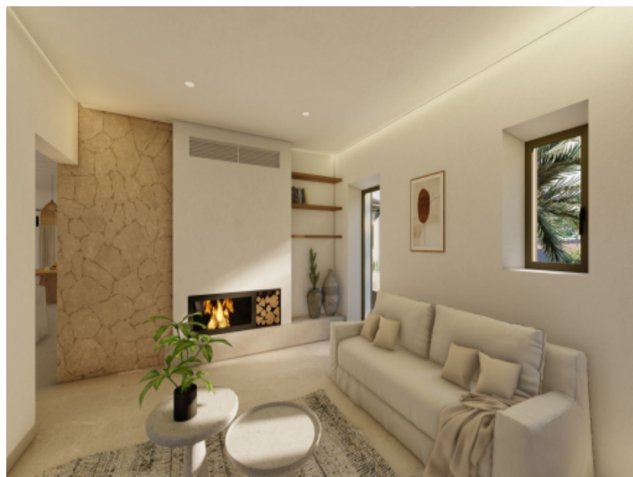
Living room with fireplace