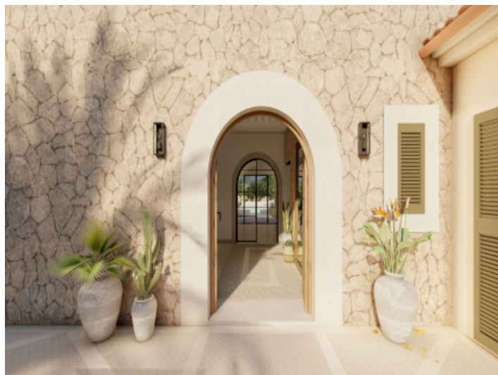
Natural stone walls