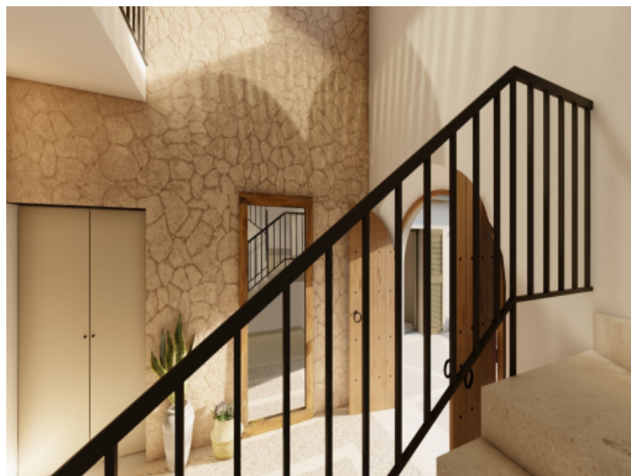
Staircase to the first floor