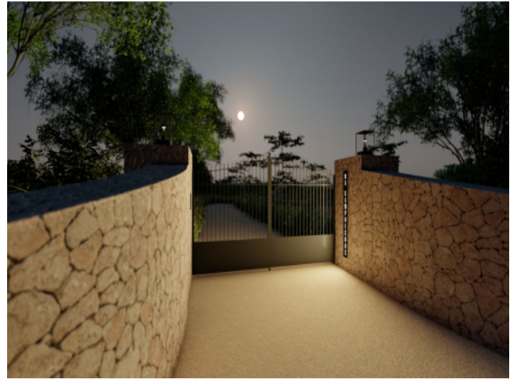
Entrance gate to the property