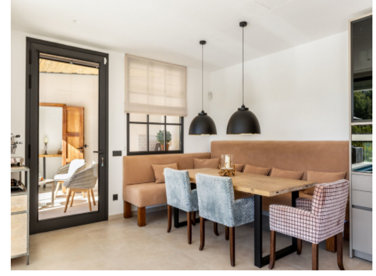
Large dining area