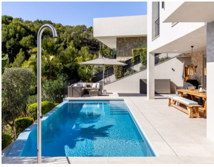
Very nice pool area