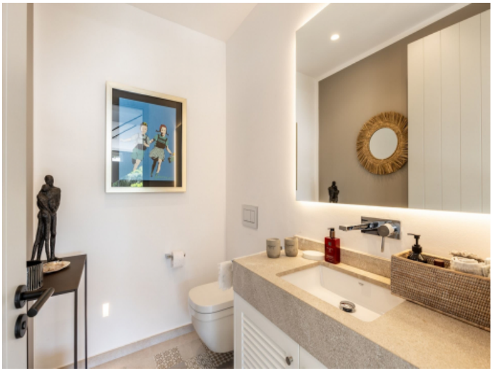
Villa with 3 bathrooms