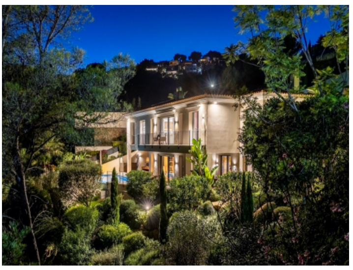
Very well mantained property