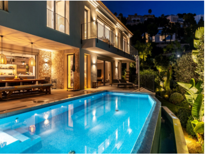
Elegant villa by night