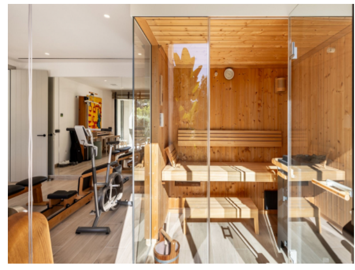
Sauna and fitness area