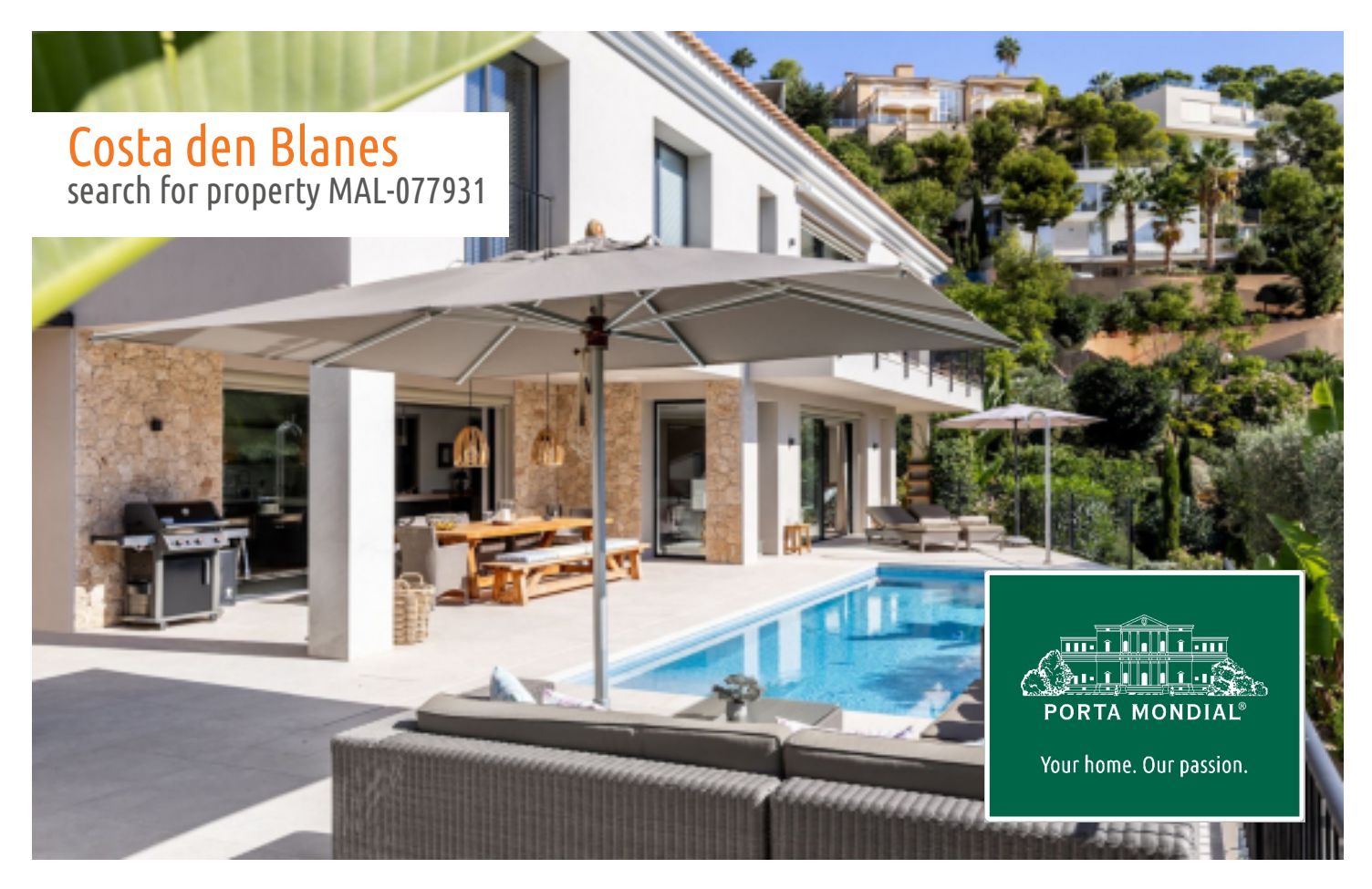
Villa in Costa d'en Blanes with luxurious wellness area