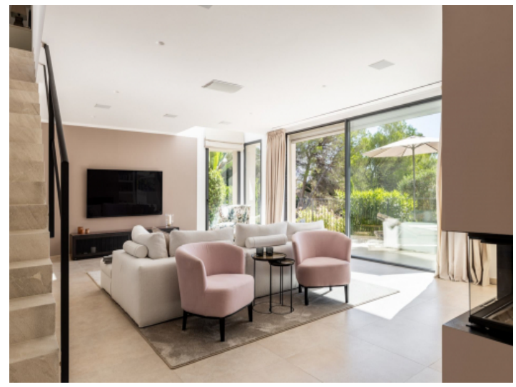
Comfortable living area