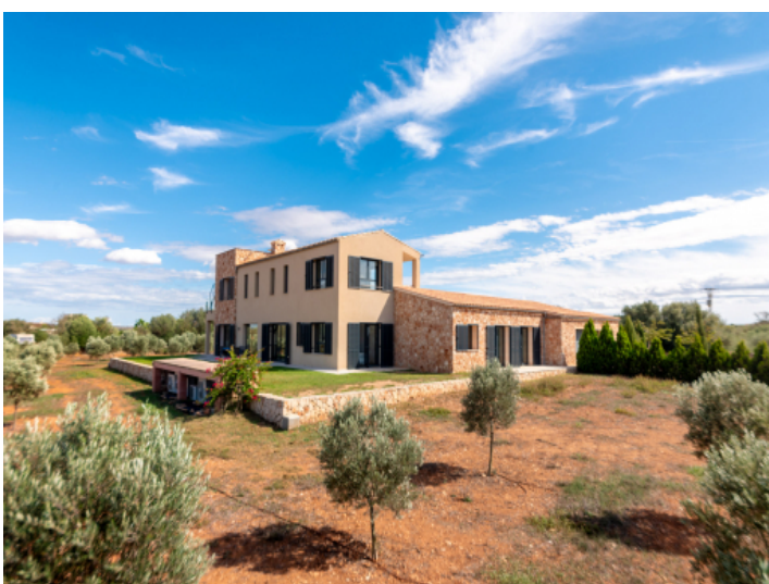
Garden and façade