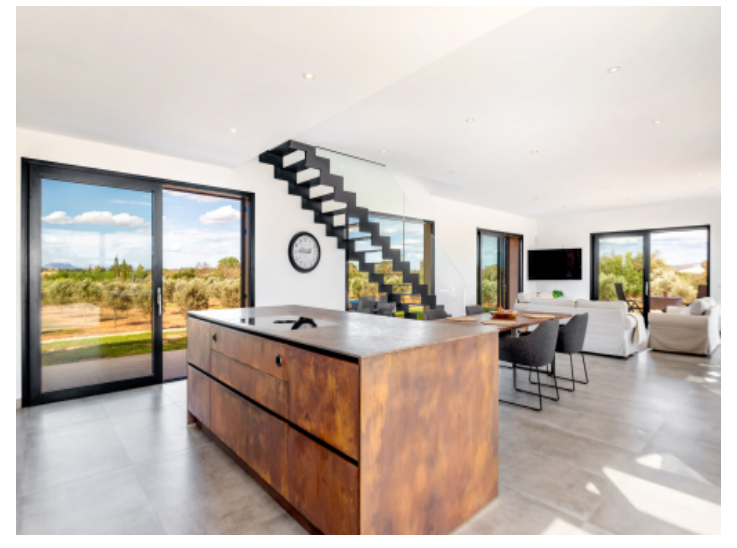
Large kitchen island