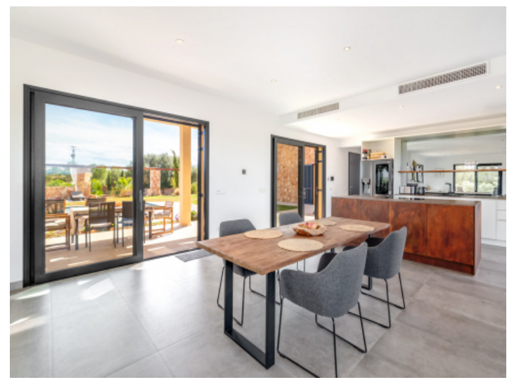
Dining area view marvelous views