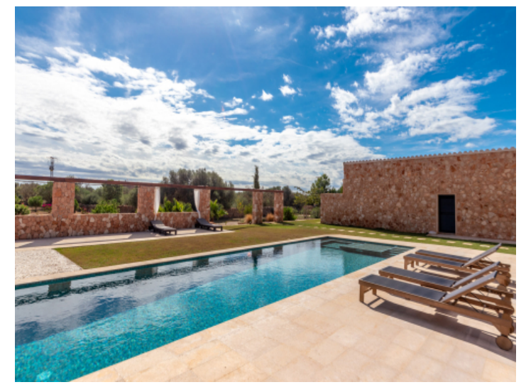
Well-maintained pool area