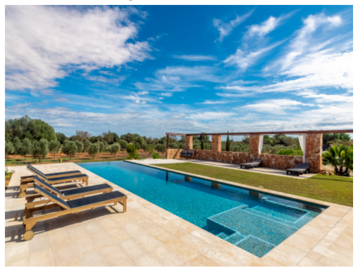
Superb pool area