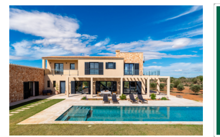
Ses Salines search for property MAL-077925