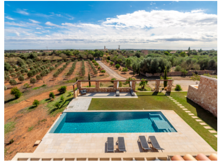
Stunning views from the first floor