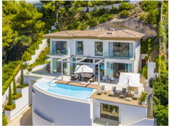
View to the villa