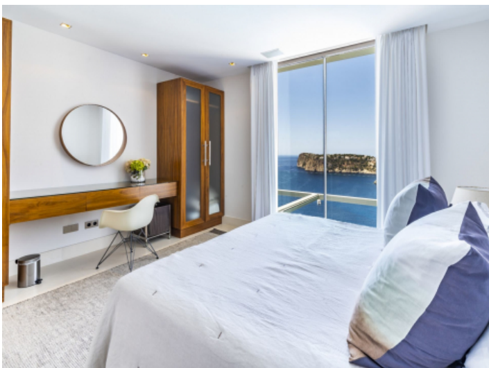
Villa with 4 bedrooms