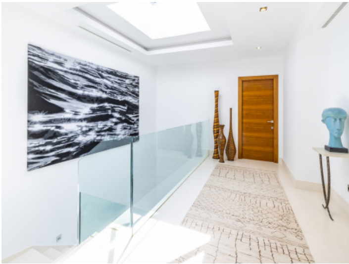
Hallway to mastersuite