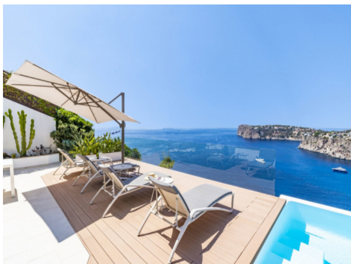
Amazing sea views