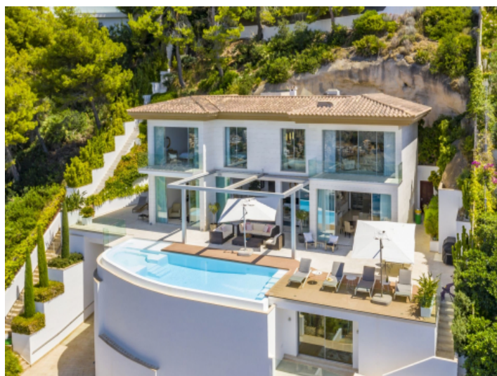
View to the villa