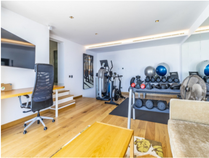
Gym and Spa