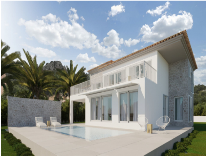
Villa with pool