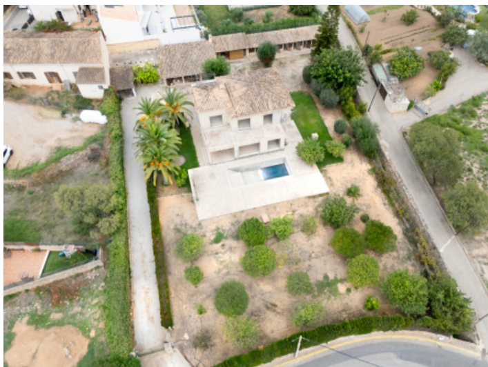
The villa and plot