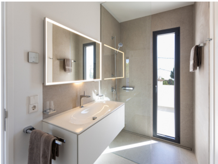
The villa offers 3 bathrooms