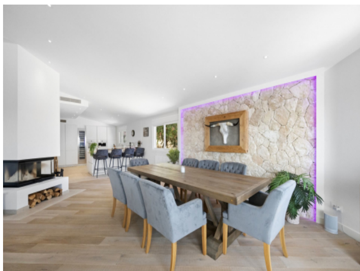
Dining area with fireplace