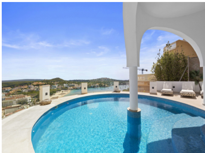
house, Costa de la Calma