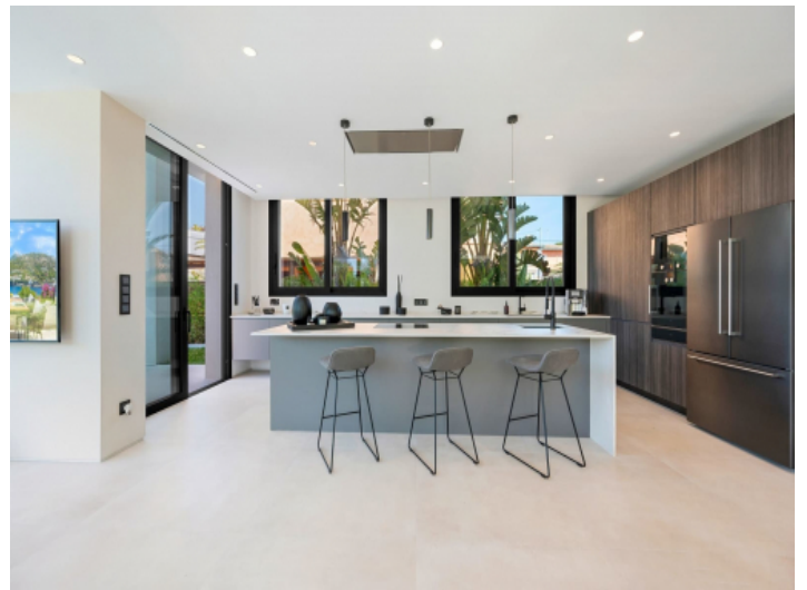
Lots of natural light