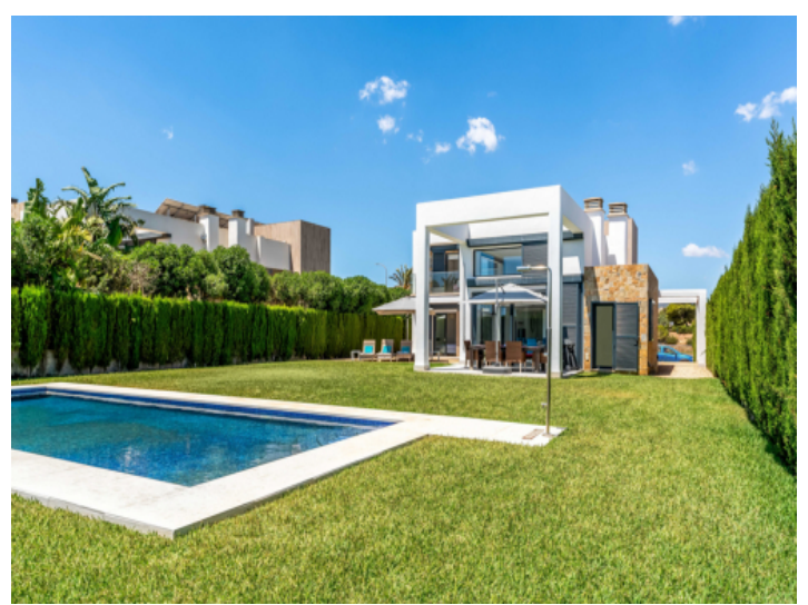
Pool and garden