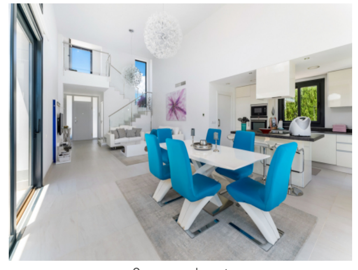
Open room layout