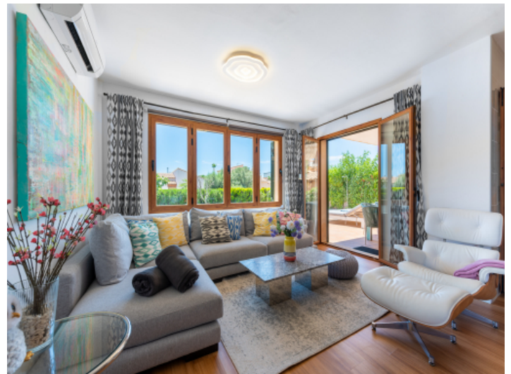
Cozy living area