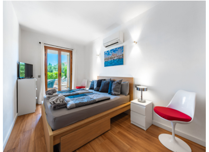
Bedroom on the ground floor