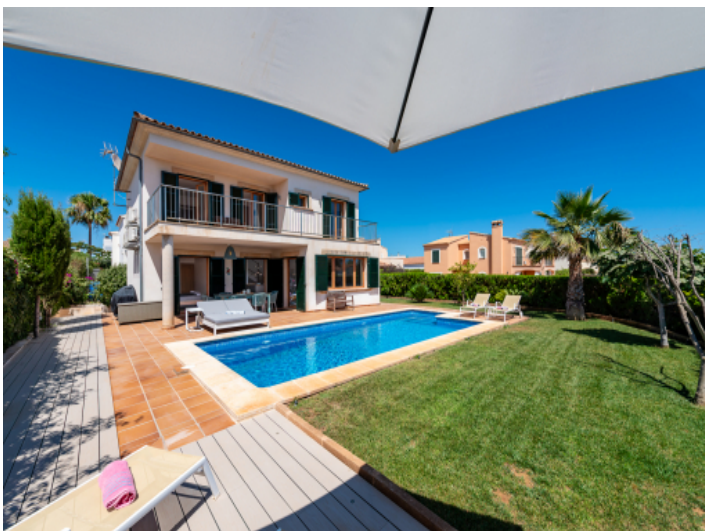
View to the villa