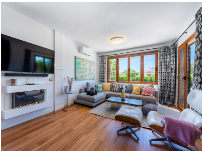
Living area with fireplace