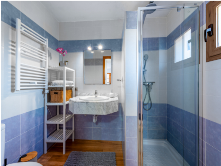
One of 3 bathrooms