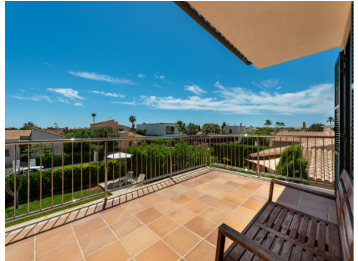
Balcony on the 1. floor with nice views