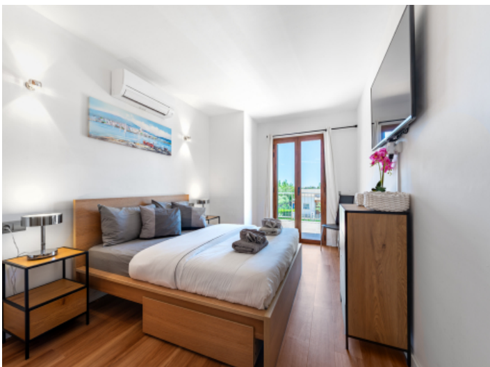
One of 4 bedrooms