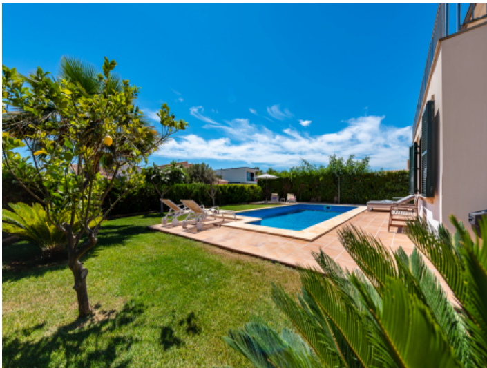
Very nice garden