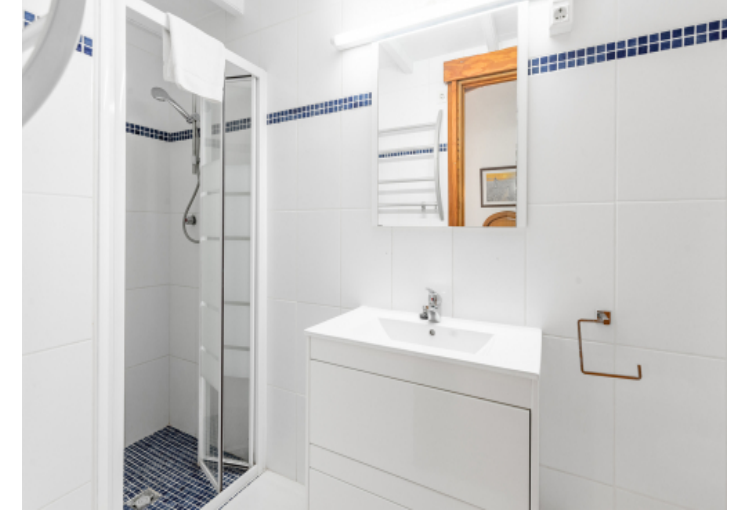
Bedroom Bath en suite