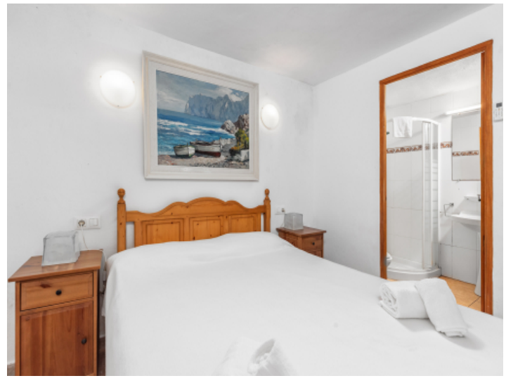
Bathroom with bathroom en suite