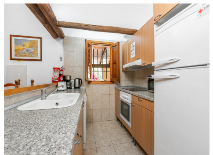
Living area Kitchen