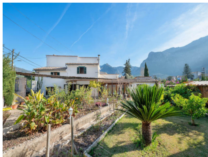
Garden and facade