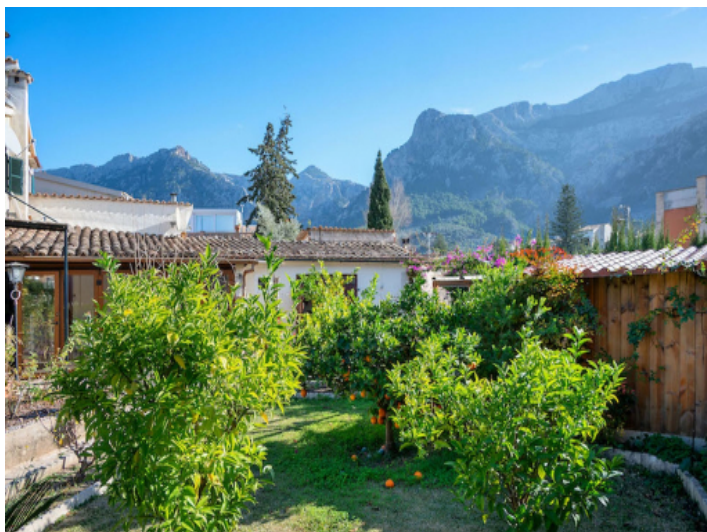
Garden and Traumtana mountain views