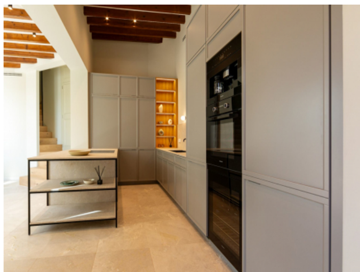
Kitchen with plenty of storage space