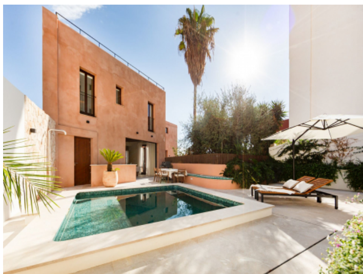
Pool and patio