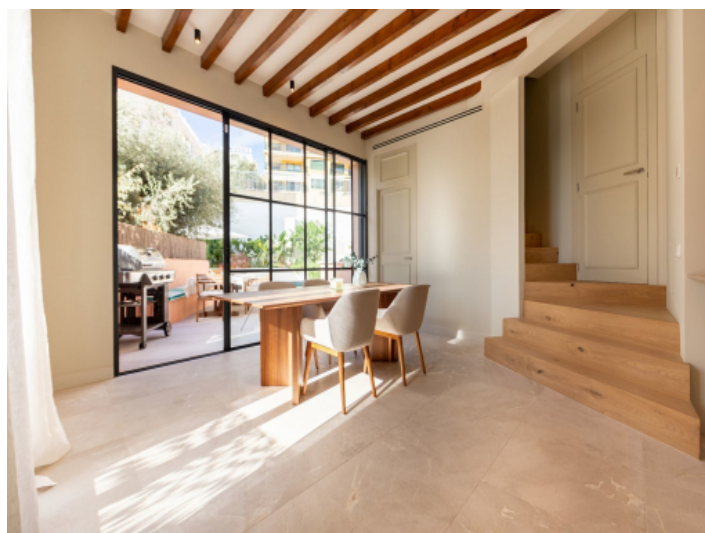
Dining area with patio views