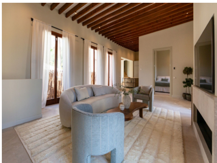
Comfortable living area