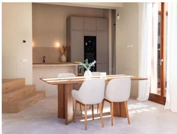
Dining area close to the kitchen