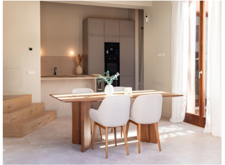
Dining area close to the kitchen