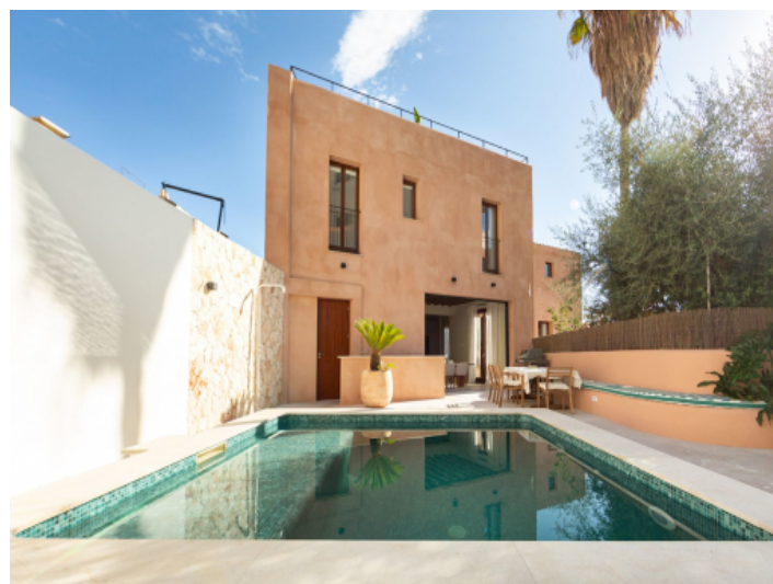
Pool and façade