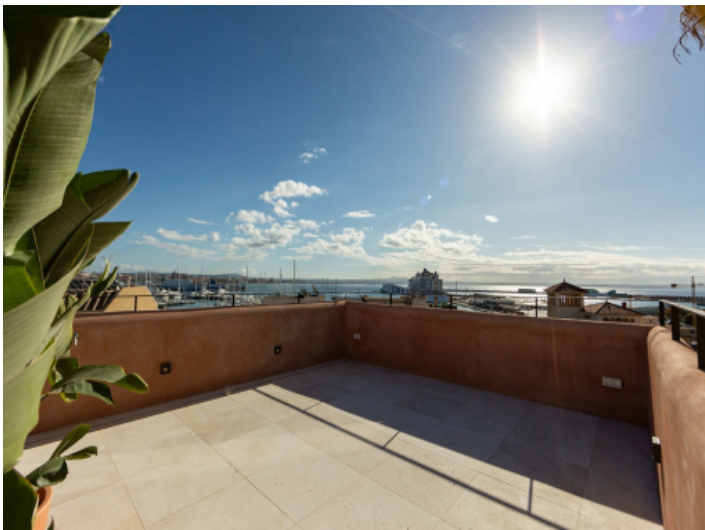
Rooftop terrace with harbour views