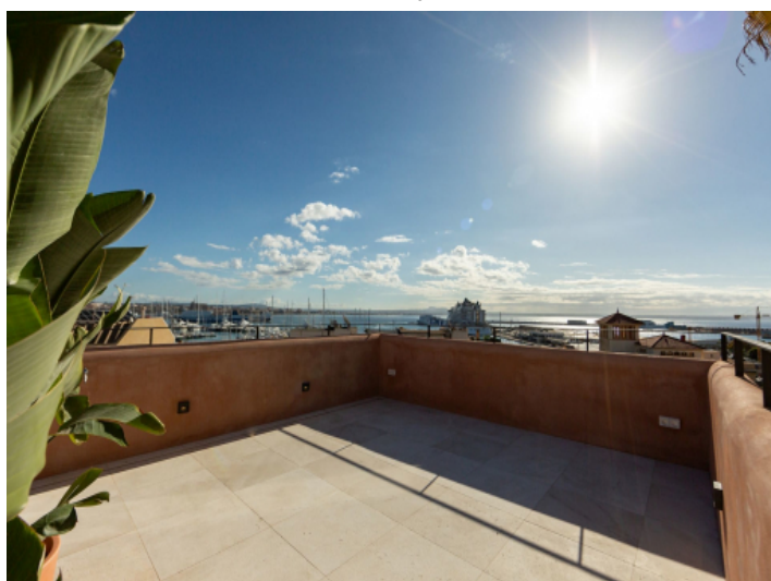
Rooftop terrace with harbour views