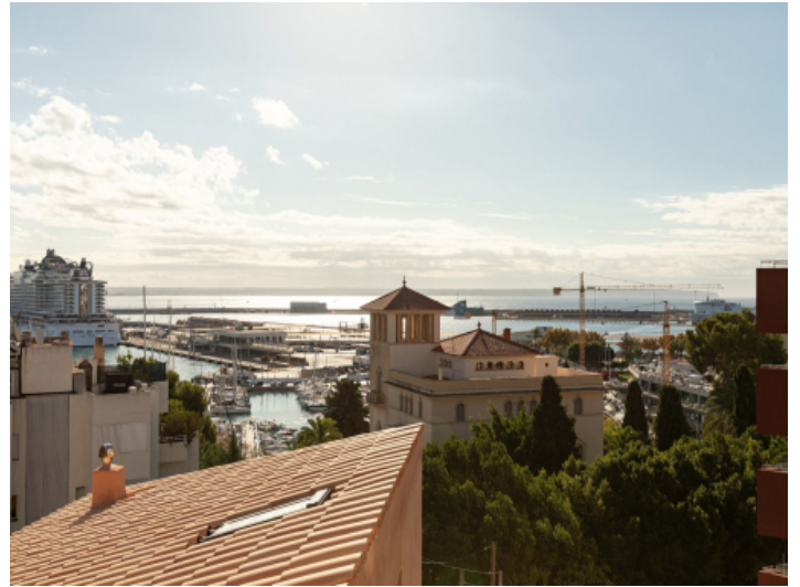
Amazing rooftop views