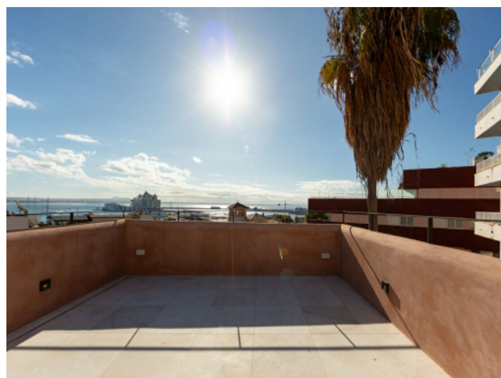
Rooftop with amazing views