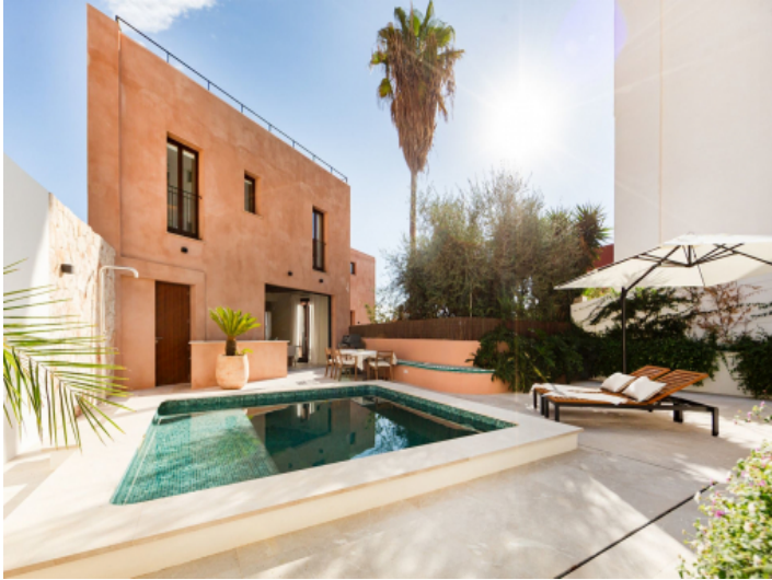
Pool and patio