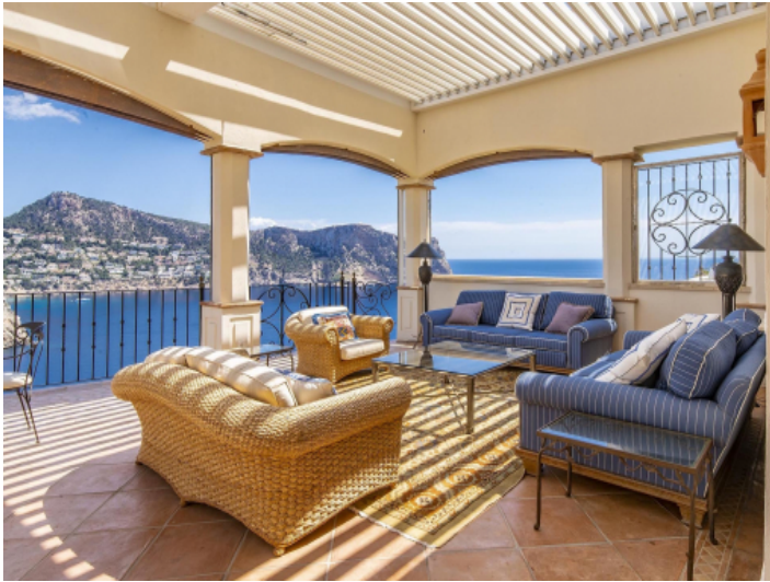
Wonderful sea view terrace