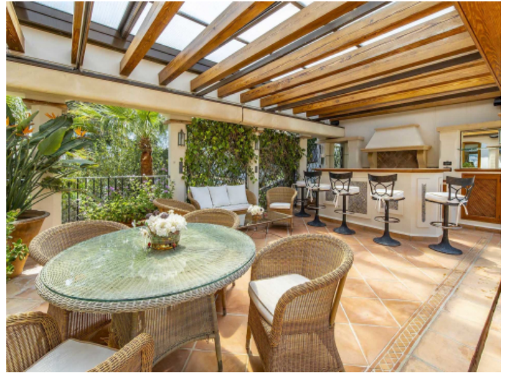
Spacious barbecue and dining area on the terrace