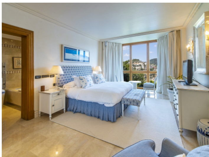
Second double bedroom with bathroom en suite