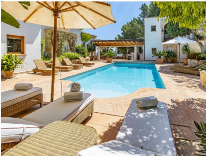
Sun loungers by the pool