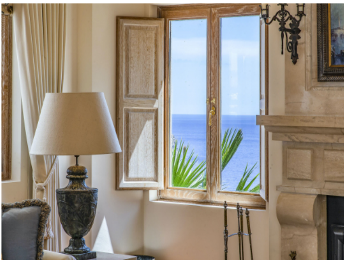
View to the sea