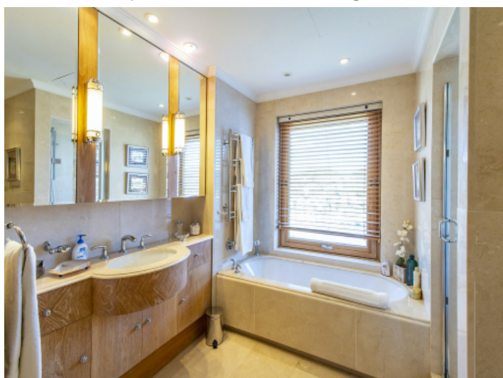
Bathroom en suite with bath tub