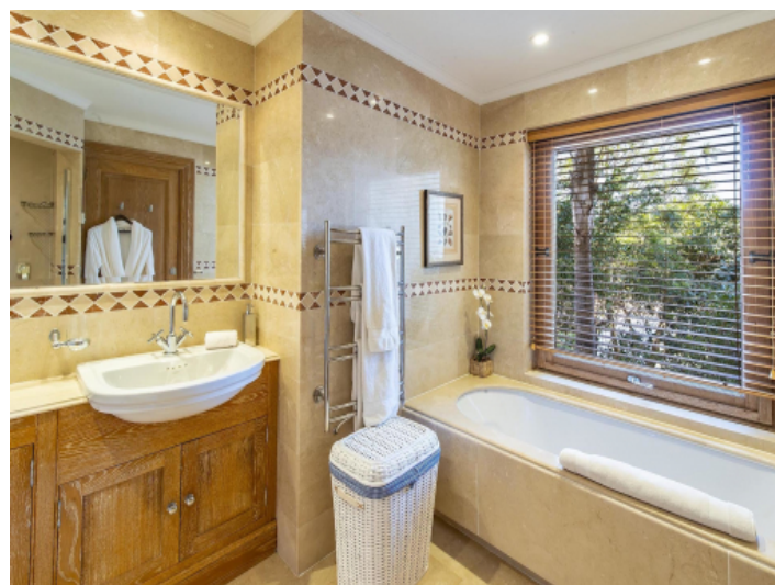
Fantastic bathroom en suite