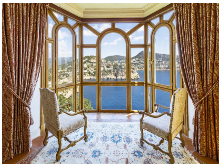
Impressive view from the dining area