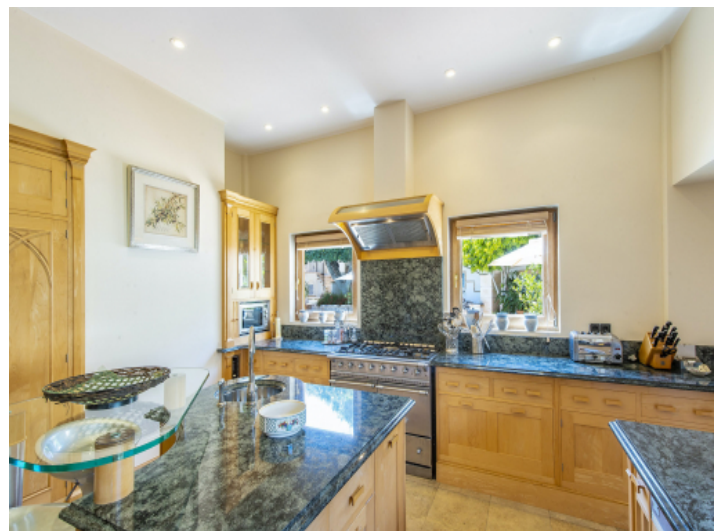
Fully equipped kitchen with cooking island