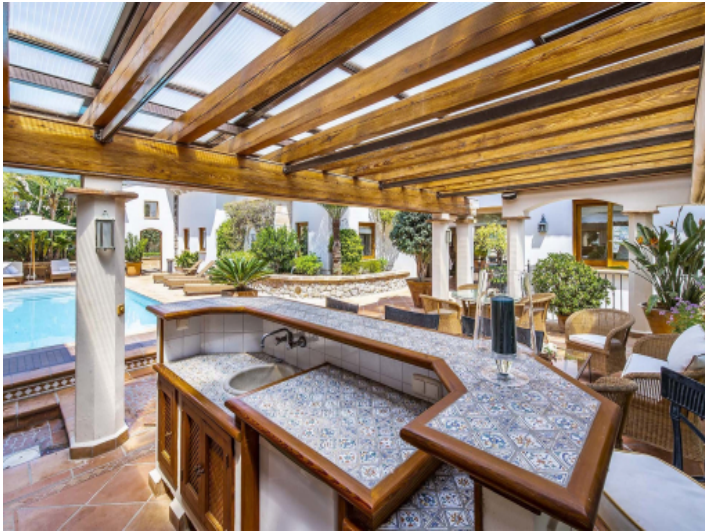
Spacious barbecue and dining area on the terrace