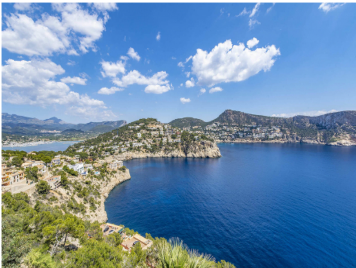
View of La Mola