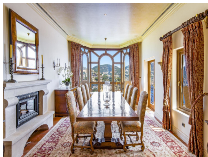
Inviting dining area