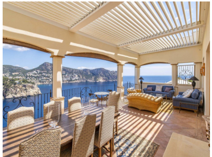
Large dining area on the terrace