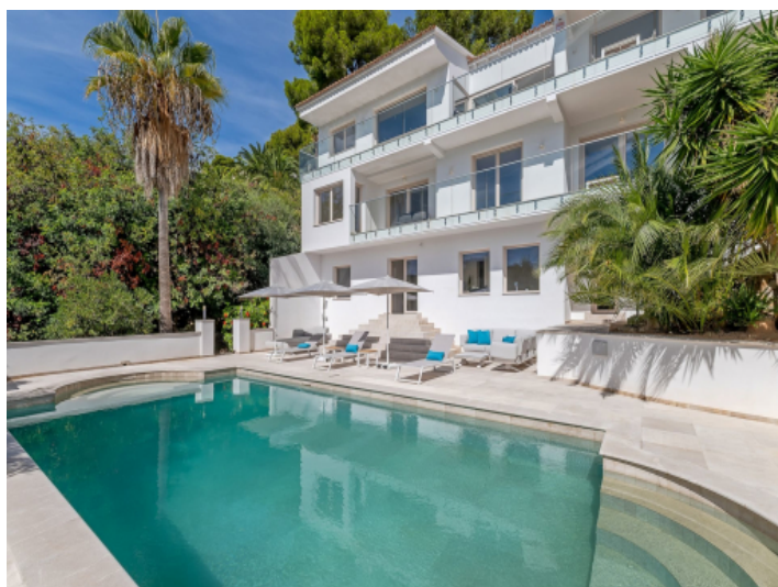
Beautiful pool area