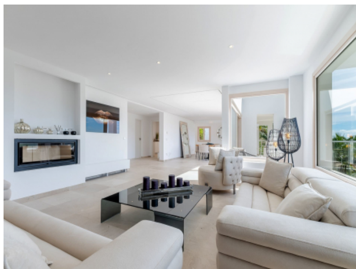
Comfortable living area with fireplace