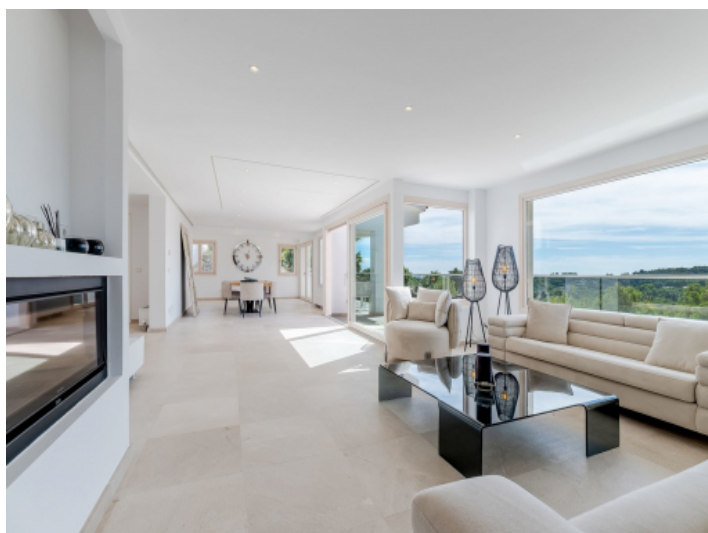
Cozy living area with views