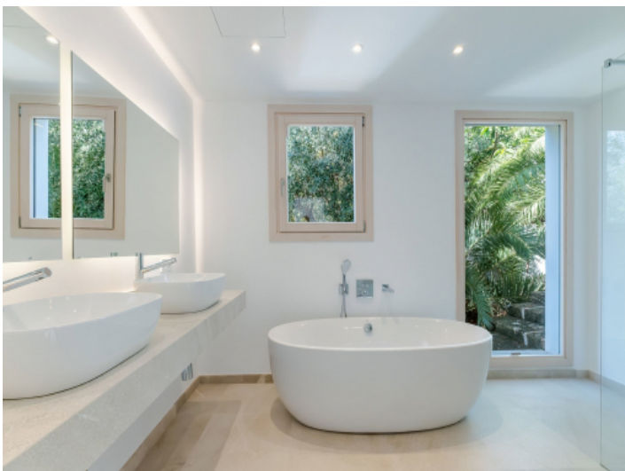
High quality sanitary facilities