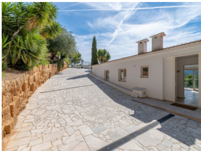
Entrance way and facade