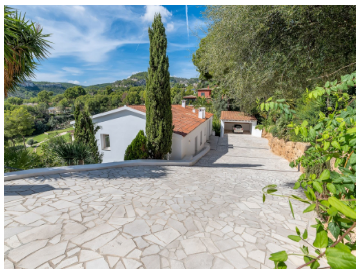
Entrance way to this little gem