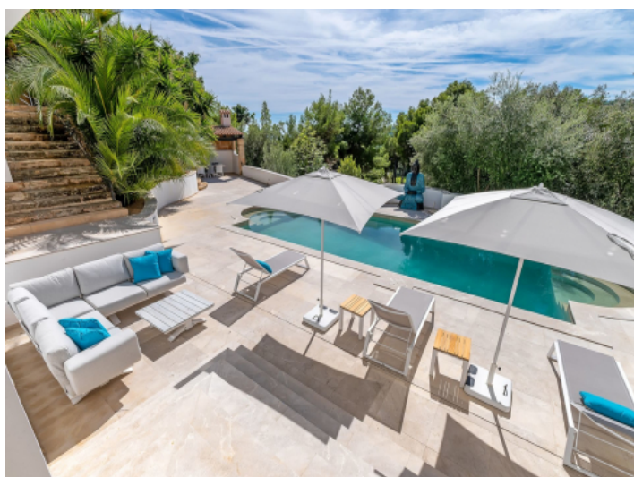
Relaxing pool area