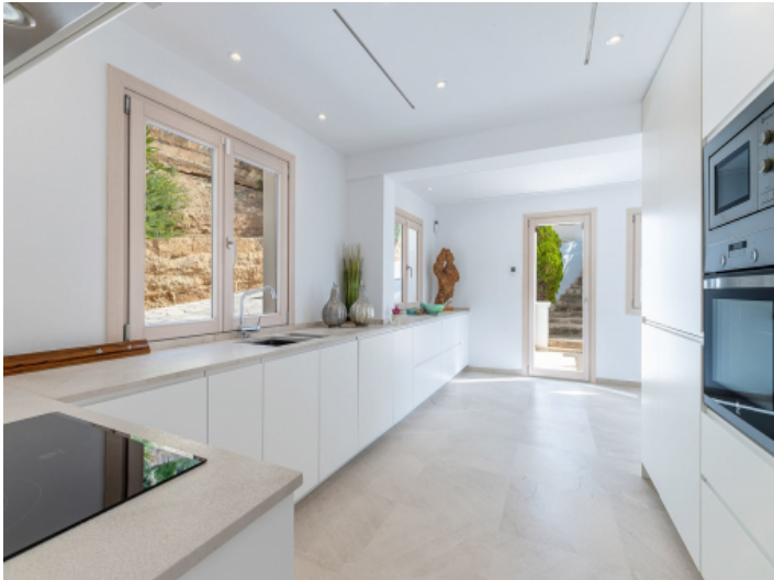
Modern quality kitchen