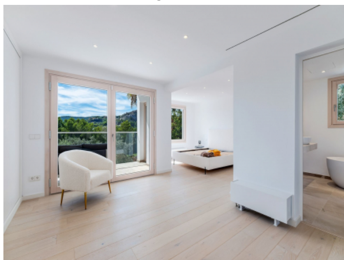
Another elegant bedroom