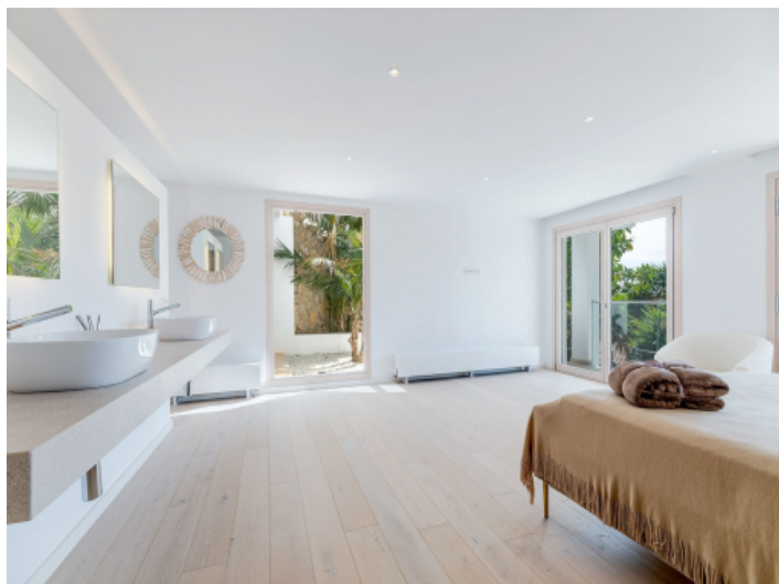
Bedroom with bathroom en suite