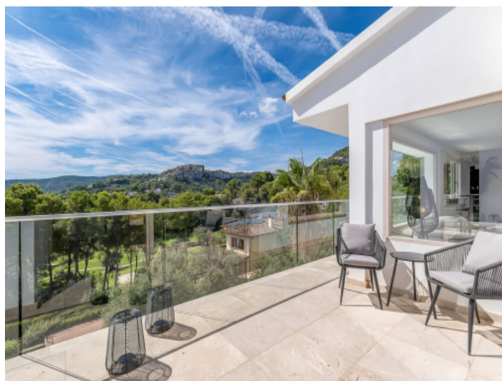
Amazing views over the green