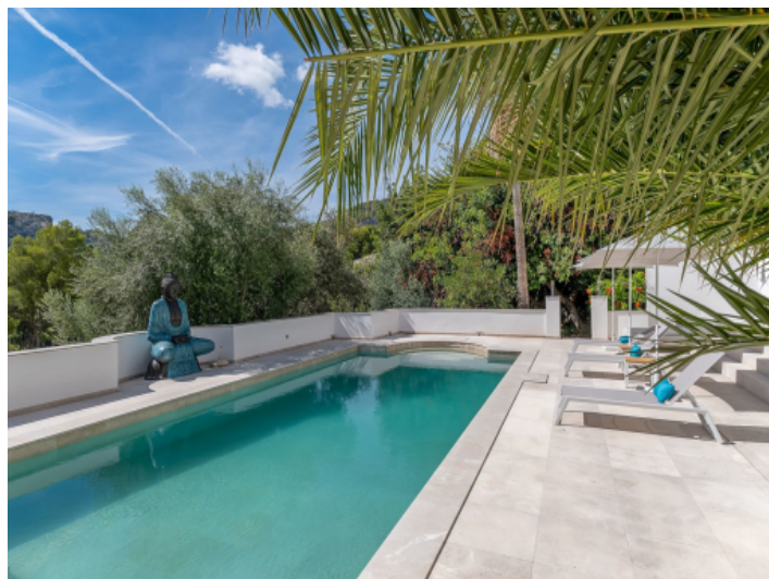
Large saltwater pool