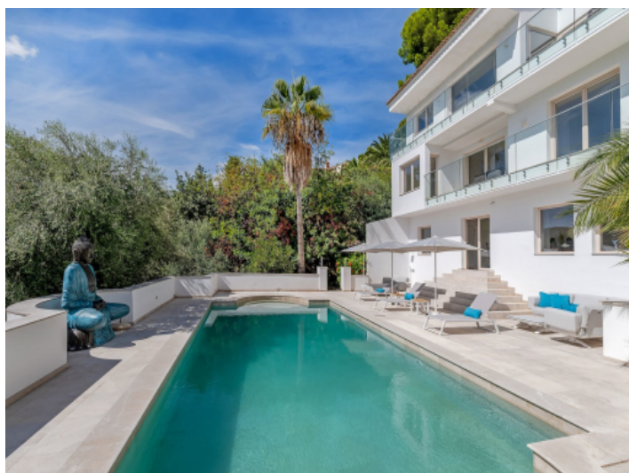
The beautiful villa in prime location