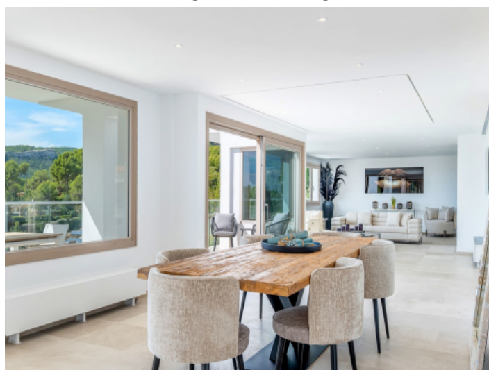
Sunny living and dining area