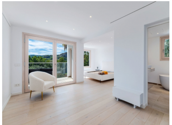
Another elegant bedroom