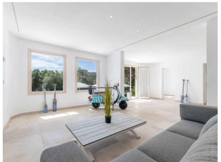
Multifunctional room close to the pool