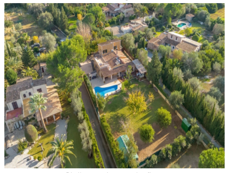
Bird's-eye-views to the finca