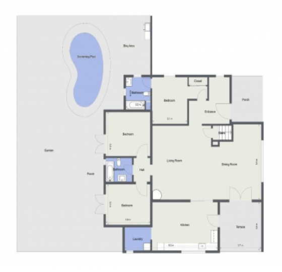
Plan ground floor