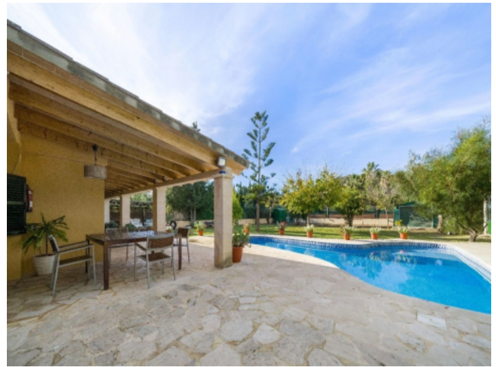
Pool views from the terrace