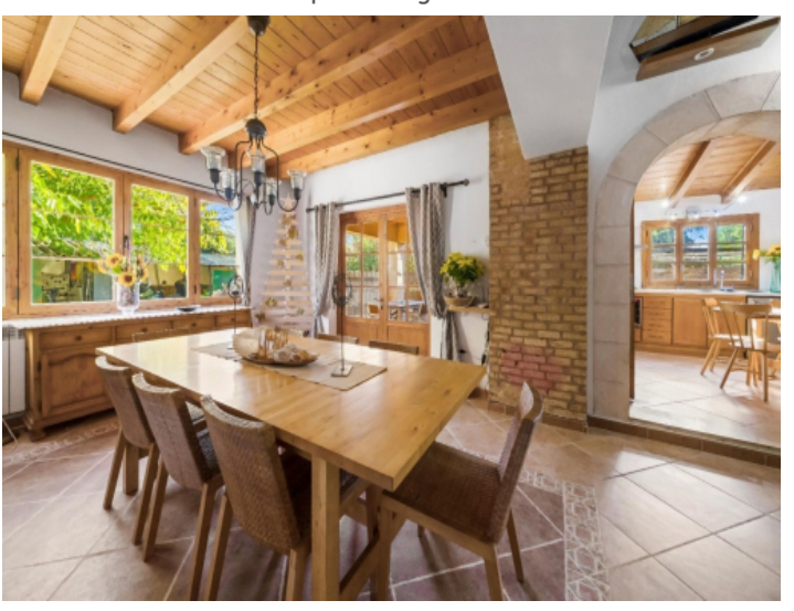
Cosy dining area