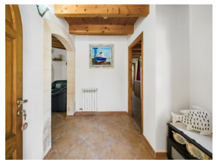
Corredor with heating