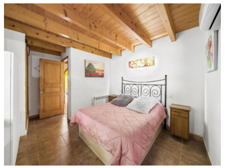
Bedroom with double bed