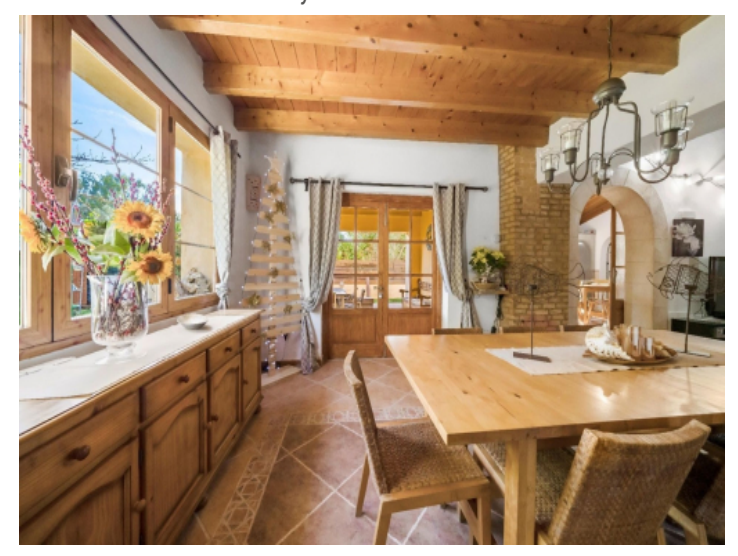
Kitchen with outside views