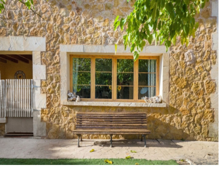
Front from the finca