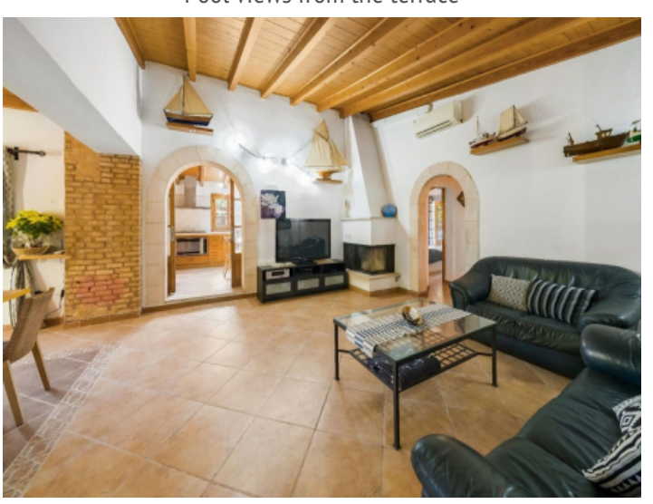
Open living area