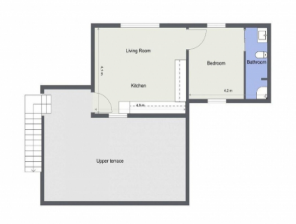
Plan first floor