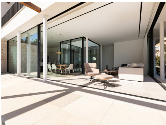
Views from the exterior to the interior