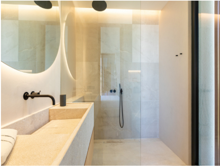
One of 5 bathrooms