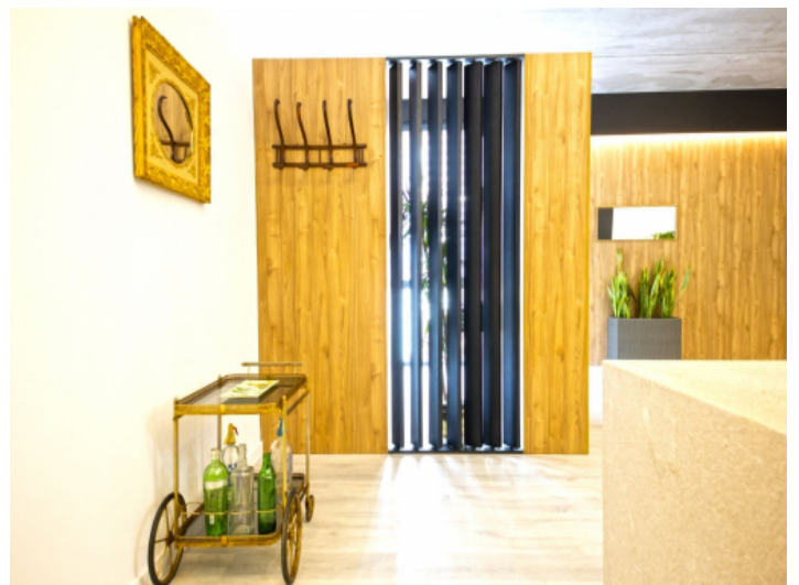
Entrance area from the house