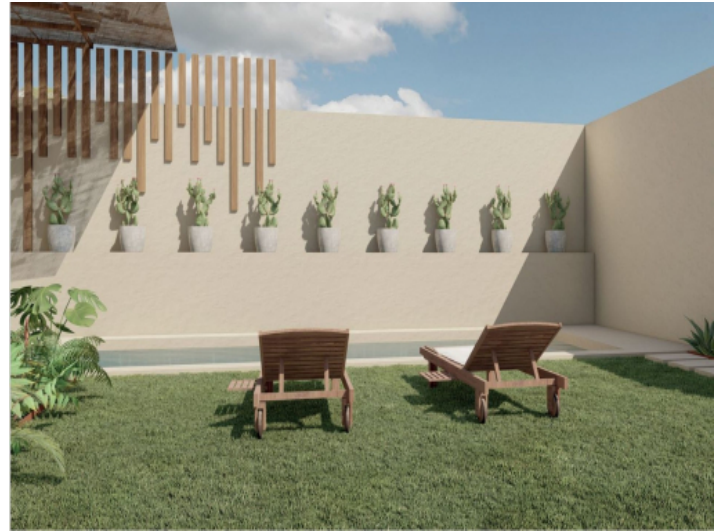
Garden with pool