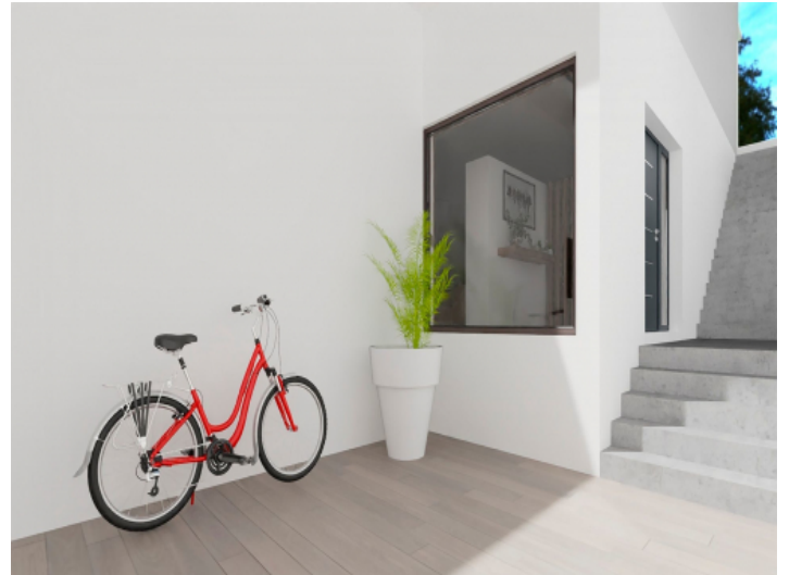
Terrace in front of the house