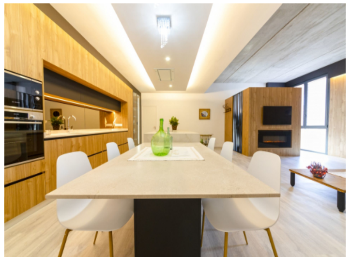
Dining area with kitchen views