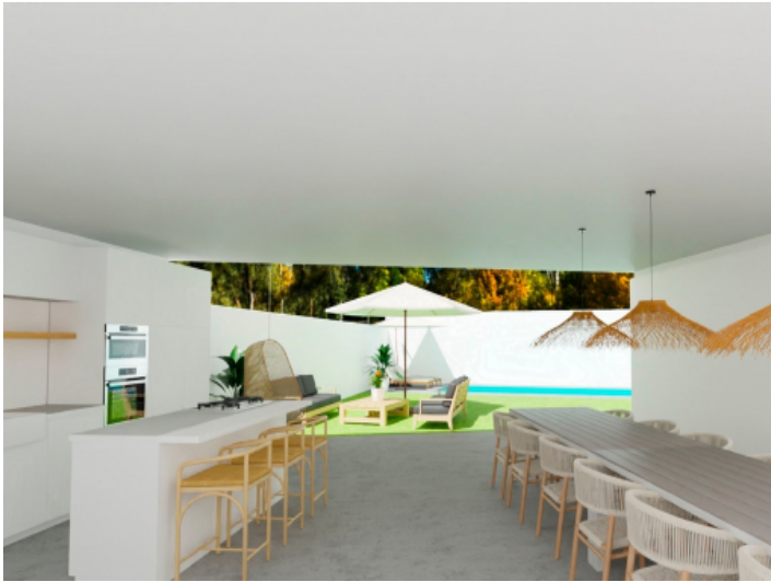
Spacious terrace with summer kitchen