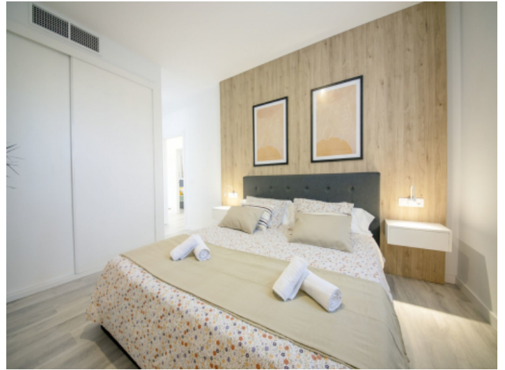
One of four bedrooms