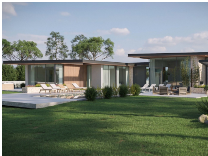
Spacious outdoor area with pool and garden