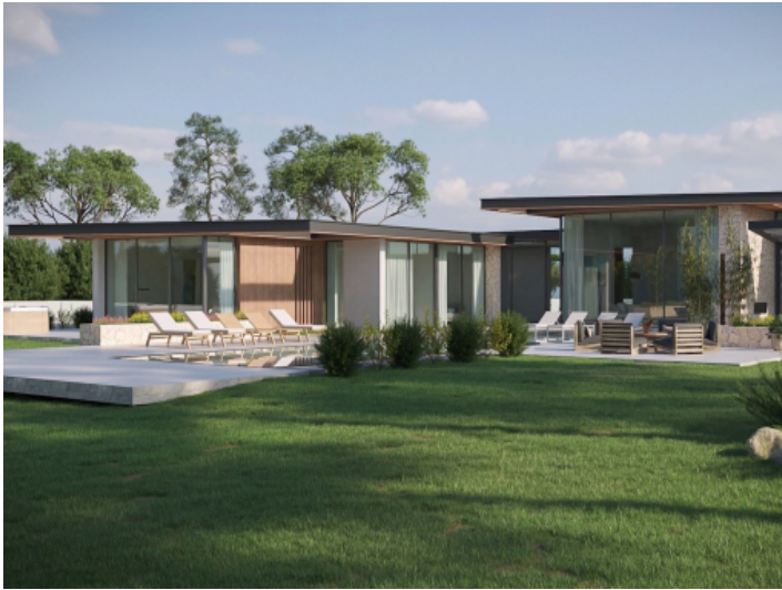
Spacious outdoor area with pool and garden