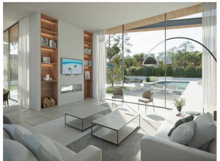
Light-flooded living area