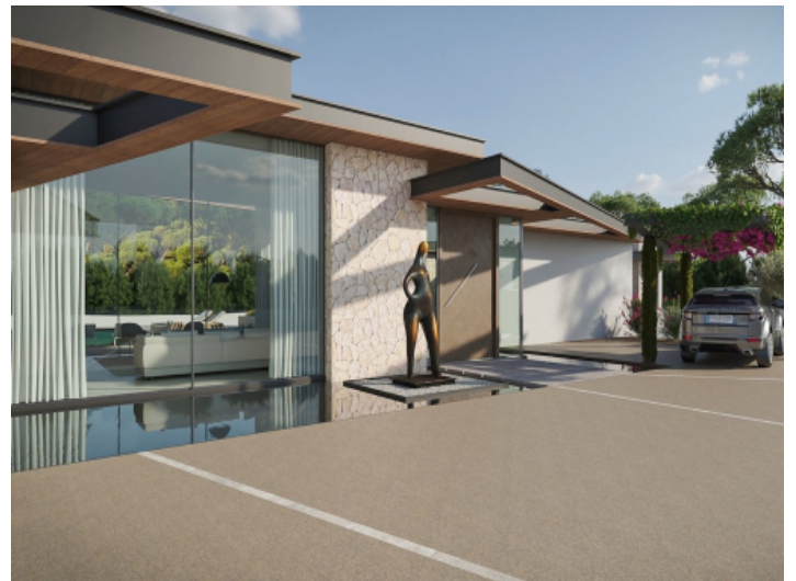
Modern entrance area