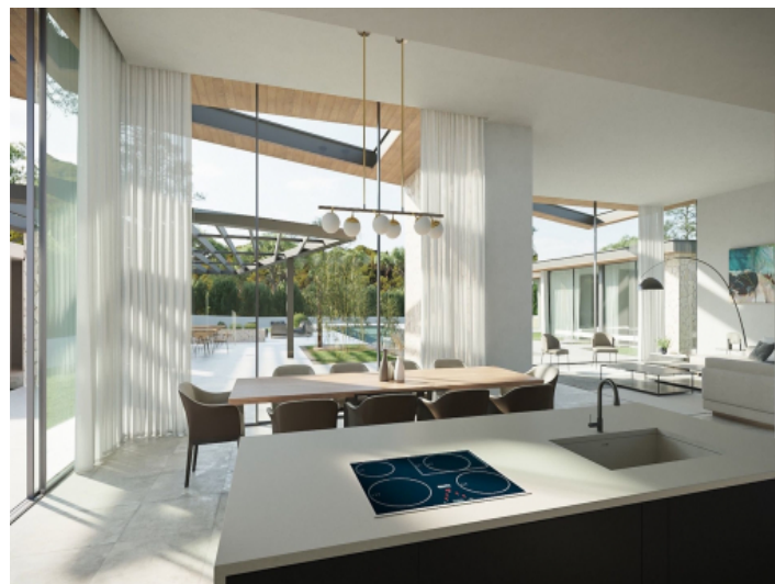
Elegant dining area and kitchen