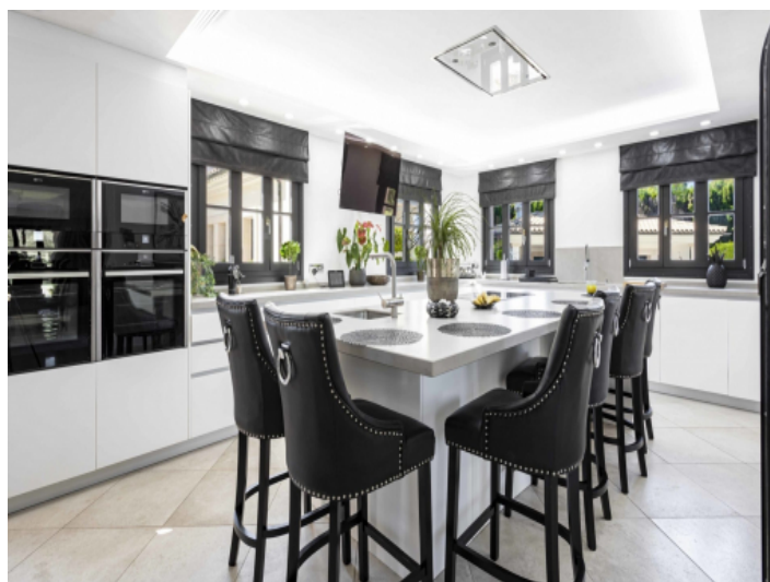
Open kitchen with dining area