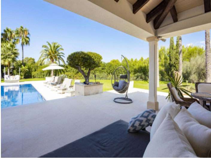
Views from the covered terrace to the pool area