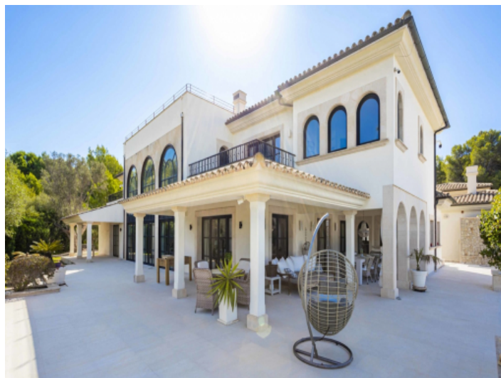
Covered terrace with lounge area