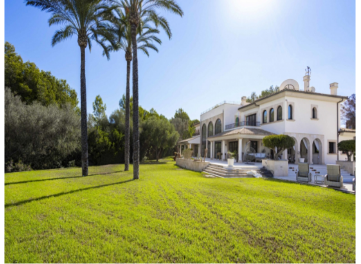
Impressive garden from the villa