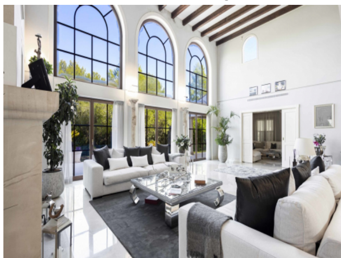
Impressive living area