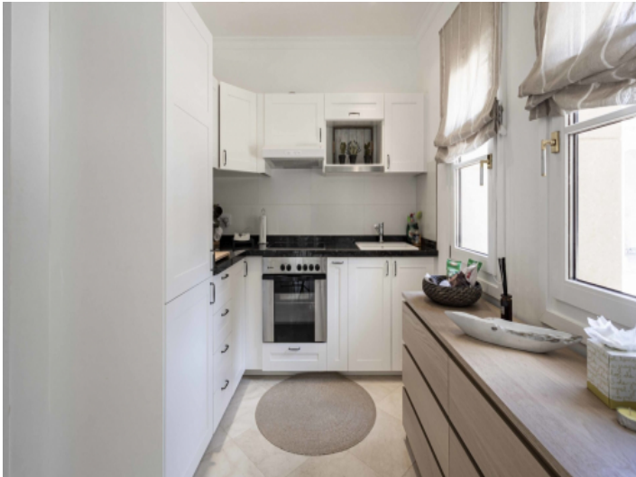
Another kitchen from the villa