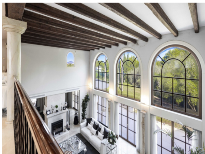
Views from the gallery to the living area