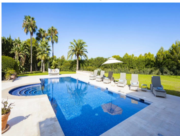
Pool is surrounded by a terrace