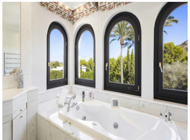
Bathroom with garden views