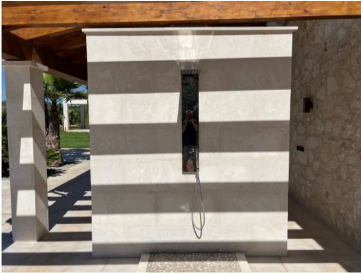
Outdoor shower from the pool area