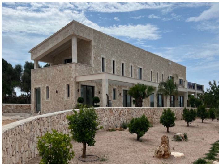
Mallorquin finca and garden