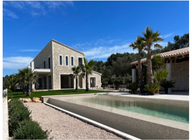
Views from the pool to the finca