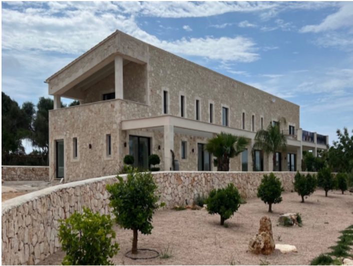
Mallorquin finca and garden