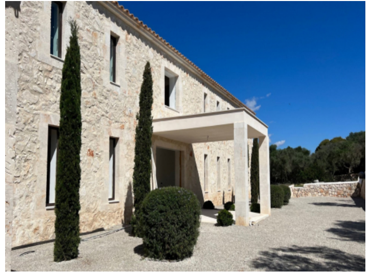
Finca with natural stone front