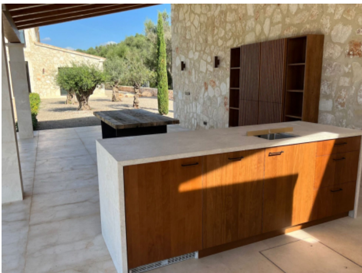
Covered terrace with summer kitchen