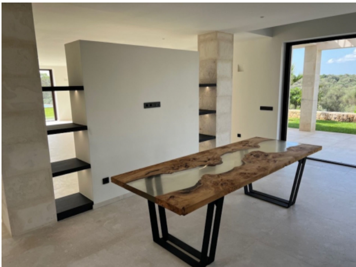
Bright dining area