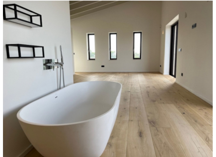
Open bathroom and bedroom