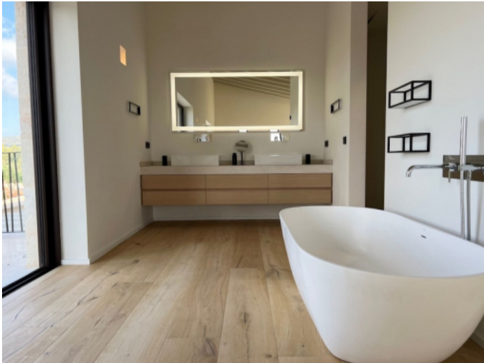
Bathroom with bathtub and daylight