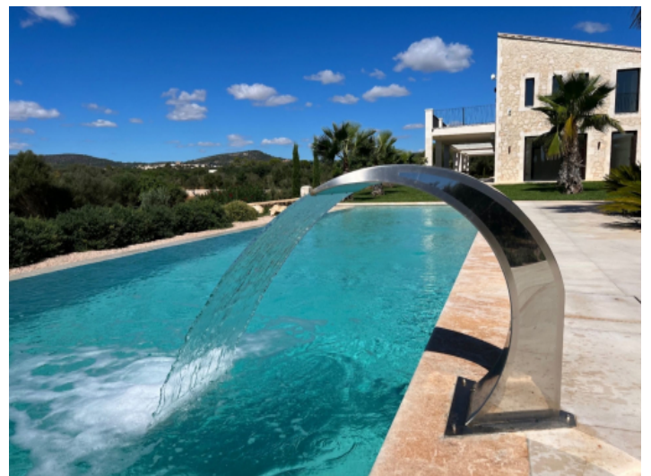
Fantastic pool area