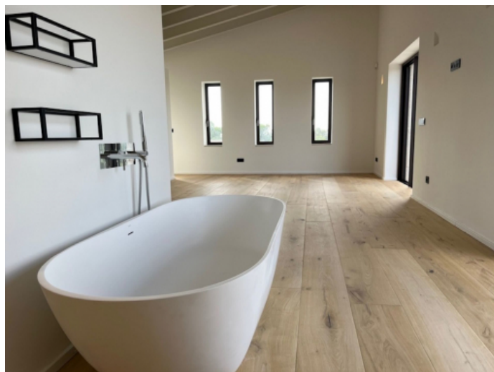
Open bathroom and bedroom