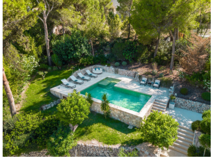
Pool oasis in a green garden