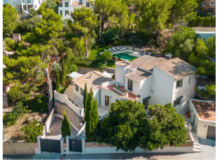
View from the street