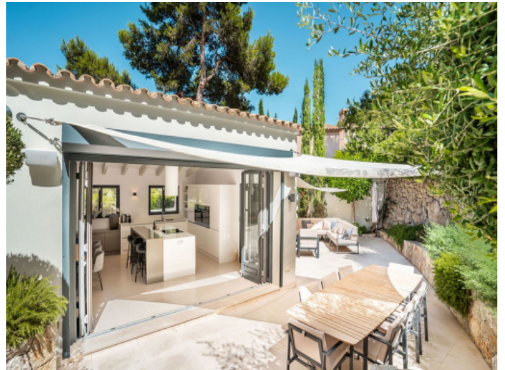
Beautiful outdoor dining area