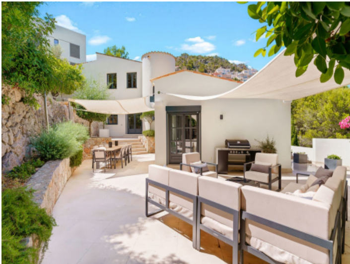
Mediterranean outdoor terraces