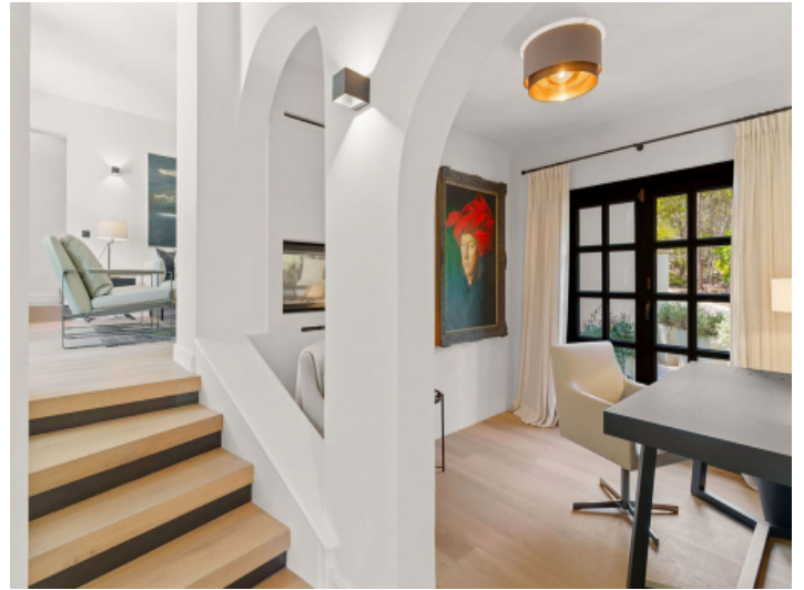
Half-open study room