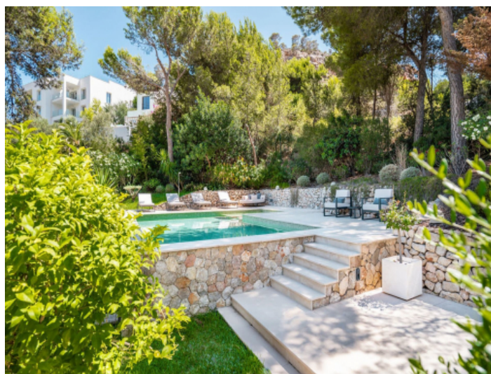
Enchanting outdoor area