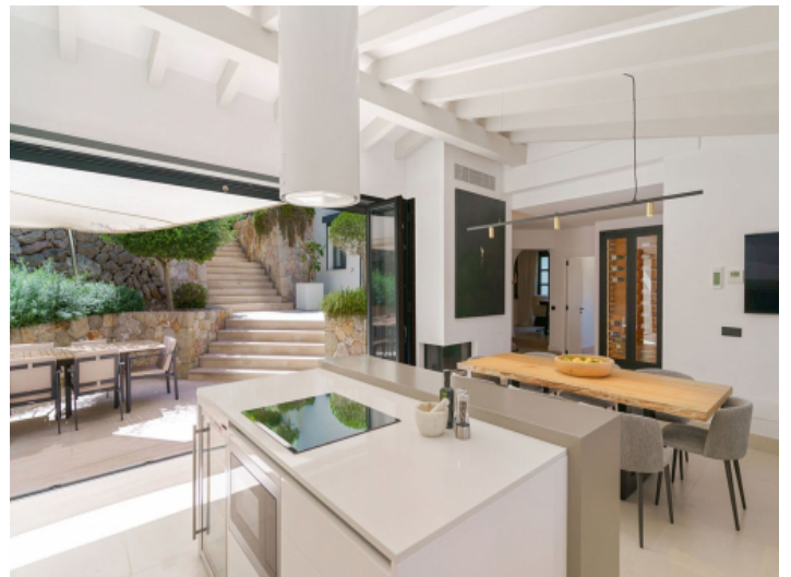
Modern, open kitchen