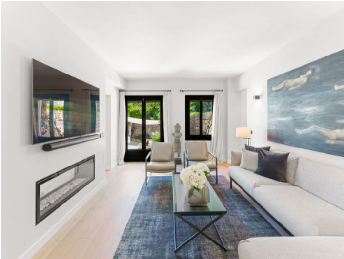
Comfortable living area