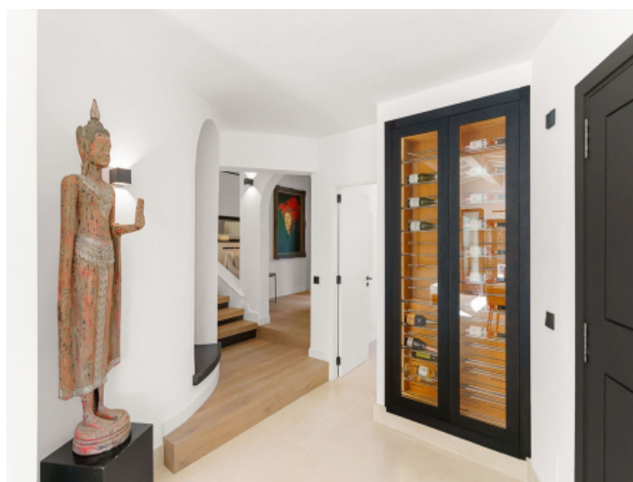
Corridor with wine cooler