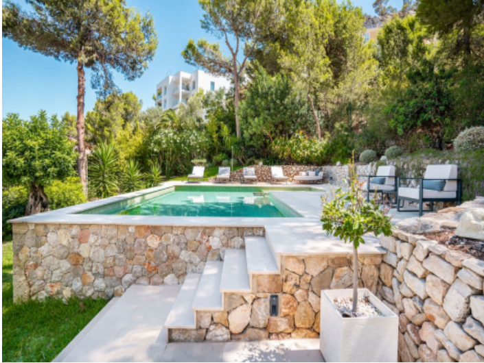
Wonderfully located pool