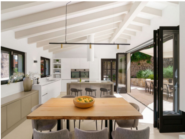
Wide access to the kitchen