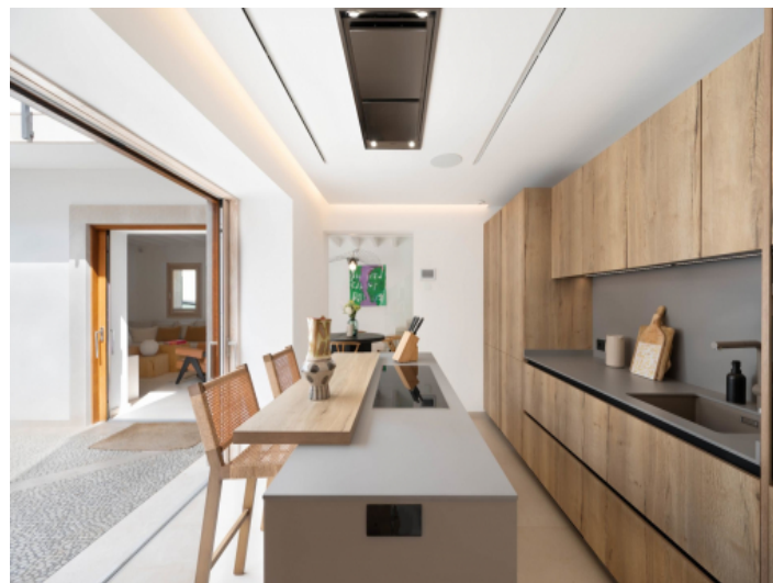
Kitchen with patio access