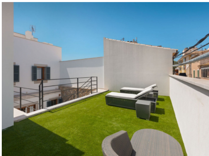
Large sun terrace