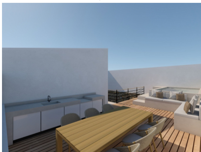
View to the future pool area