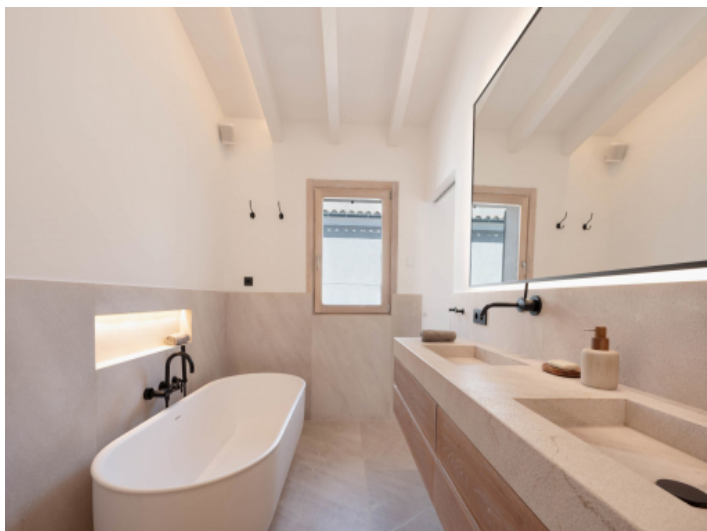
One of 3 bathroom