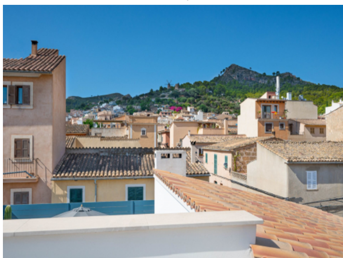
View over Andratx