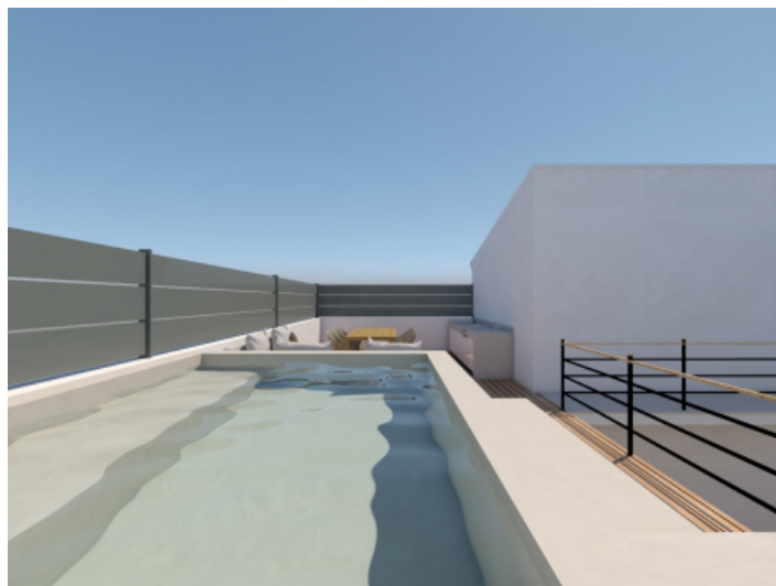
Future pool area