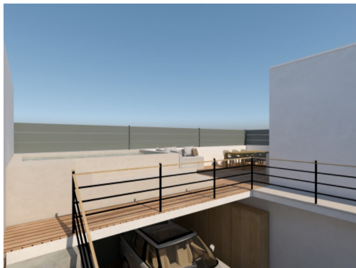
Future pool area