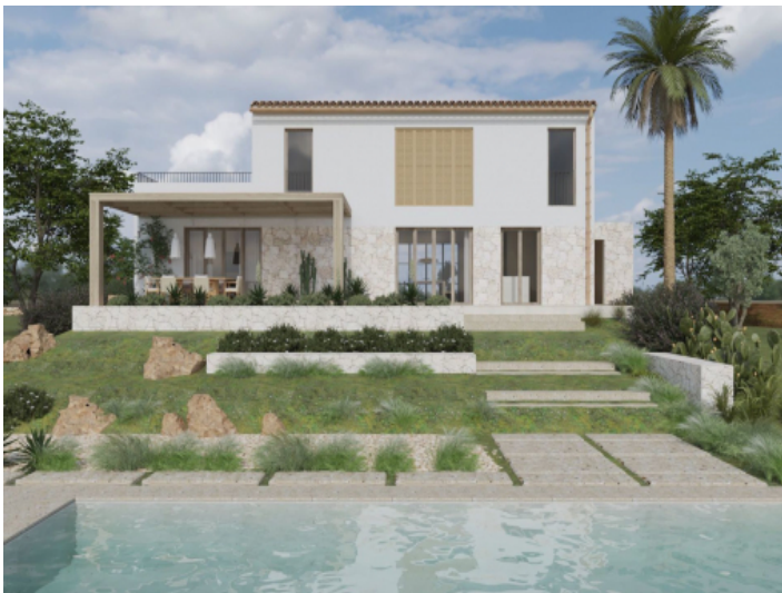
Pool area and garden