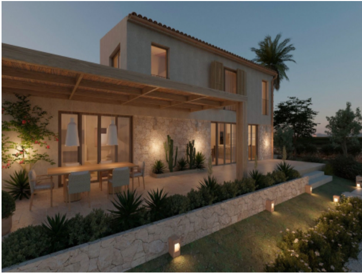
Exterior view at night