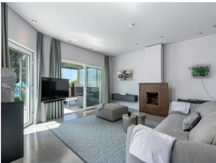
Living area with floor-to-ceiling windows