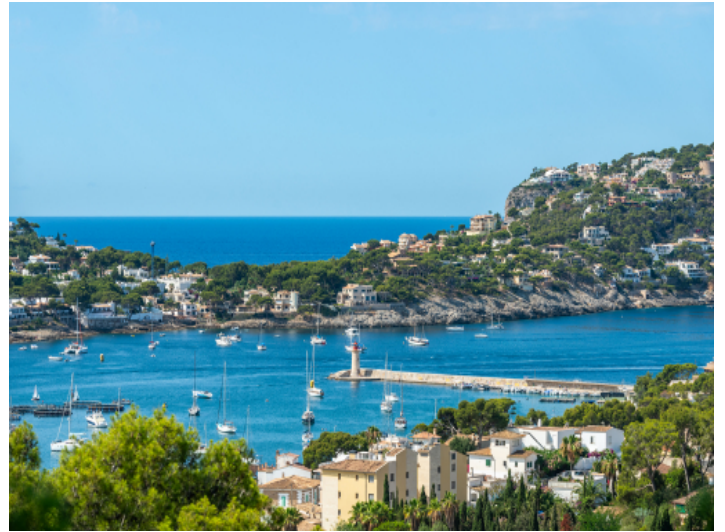
Stunning sea views