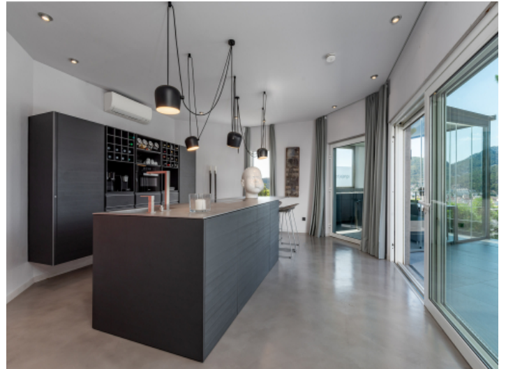
Kitchen with direct terrace access