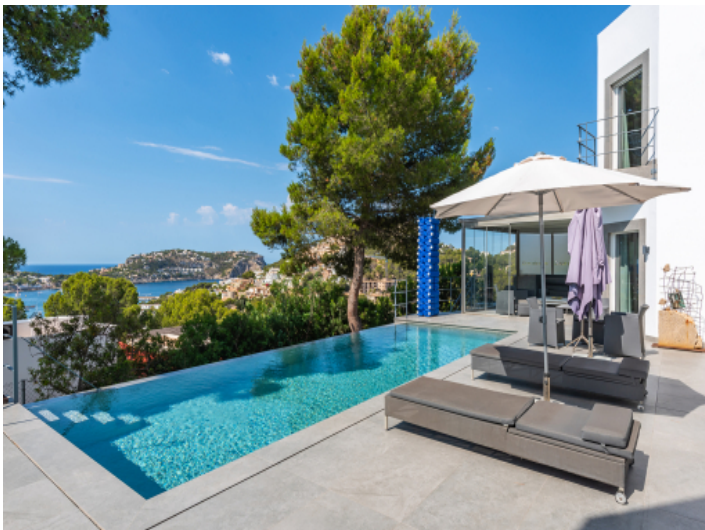
Fantastic pool area