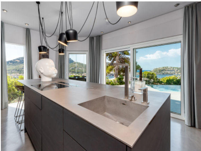
Kitchen with cooking island