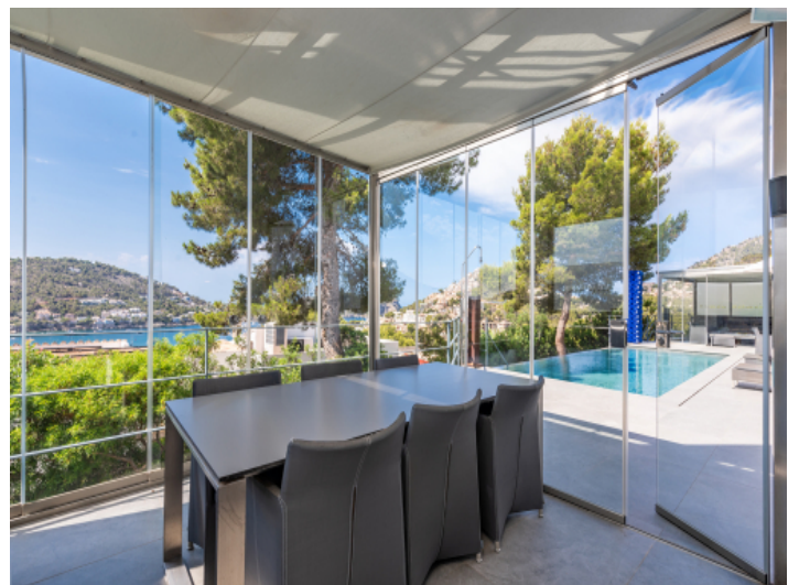
Light flooded dining area