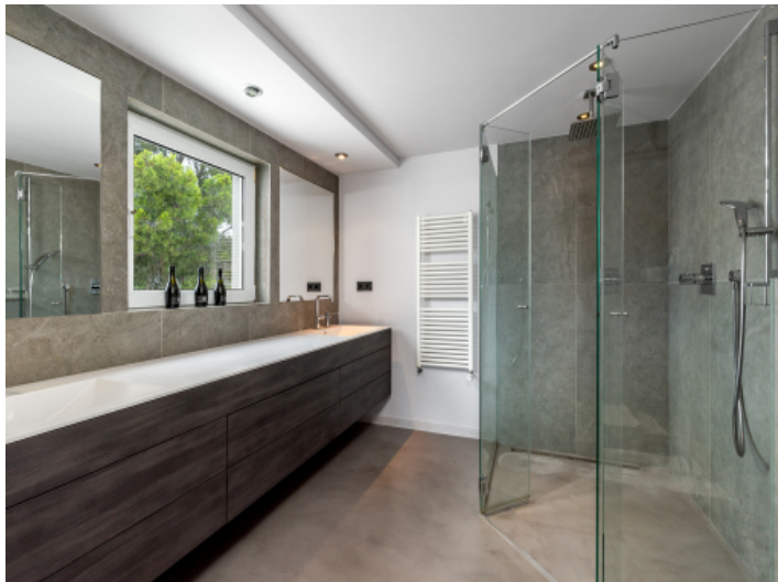
Bathroom with walk-in shower