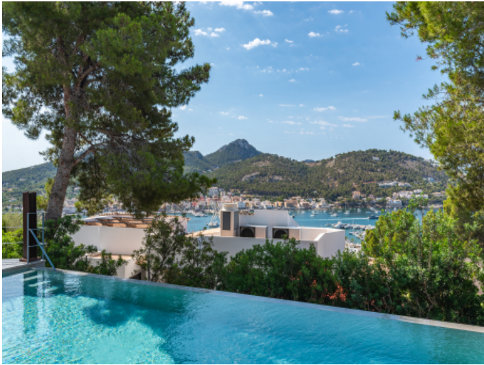
Infinitypool with sea views