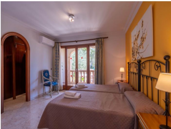
One of 4 bedrooms