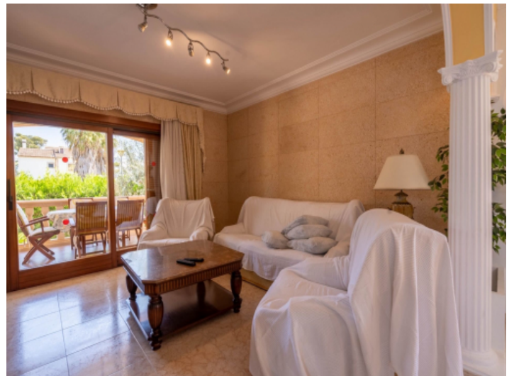
Living area with access to the terrace