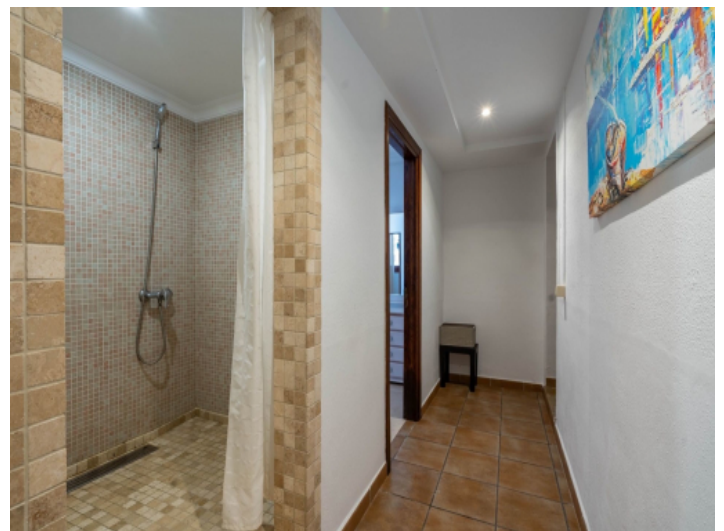
One of 3 bathrooms