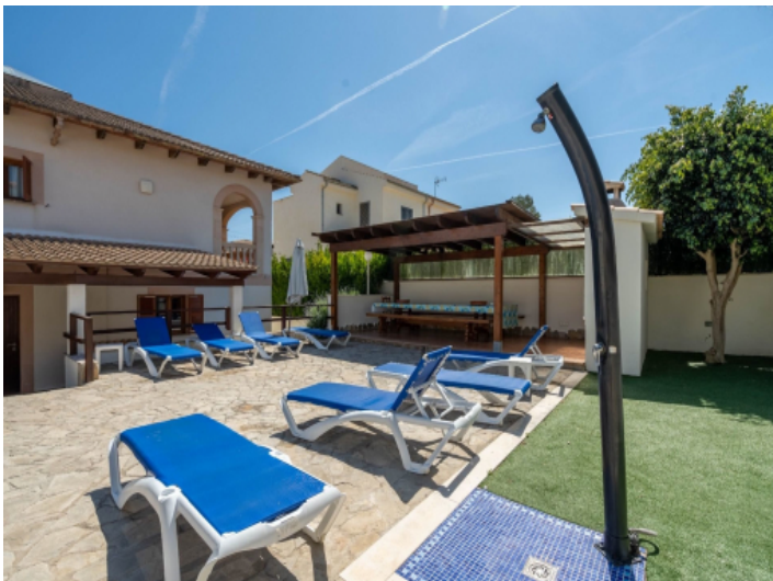
Sunny terrace with outdoor shower