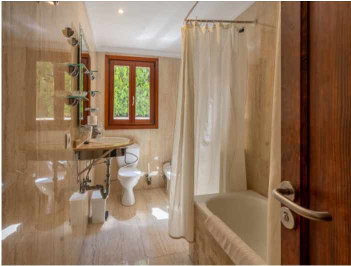
One of 3 bathrooms