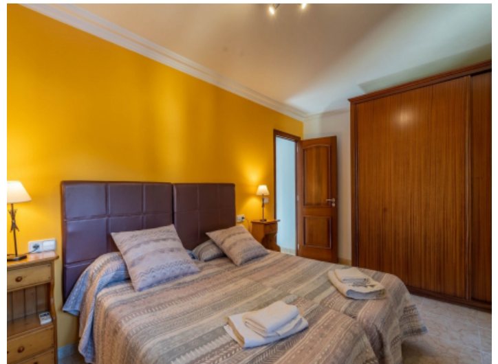
One of 4 bedrooms