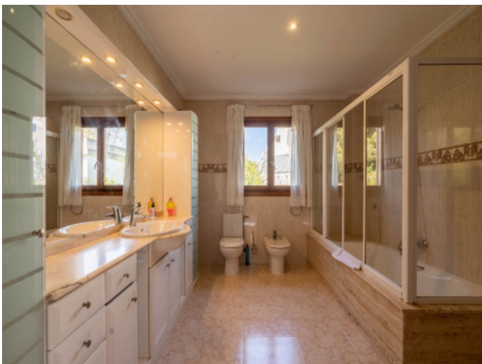
One of 3 bathrooms