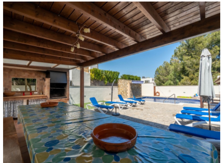
Covered terrace with BBQ area