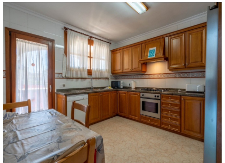
Fully equipped kitchen