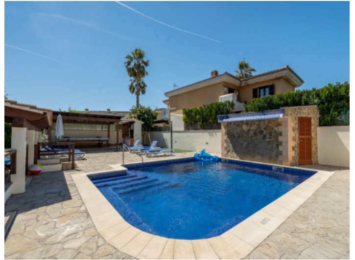
Large pool area