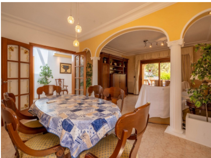
Elegant living and dining area