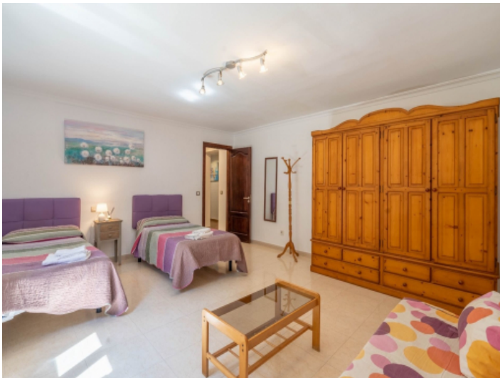
One of 4 bedrooms