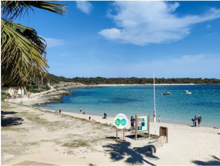
Located directly at the beach