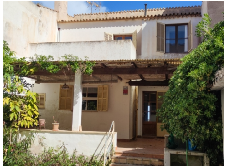
View of the house