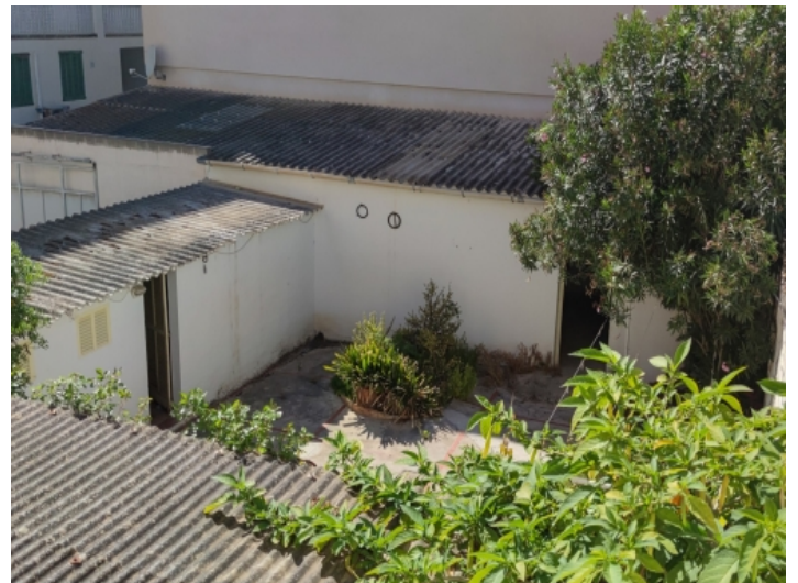
View into the patio